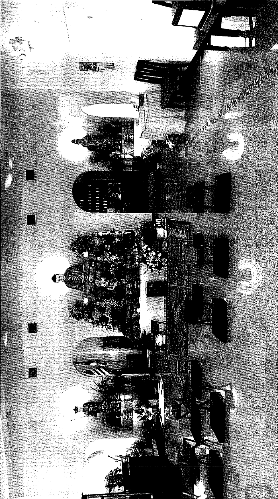
VIEW OF TEMPLE INTERIOR