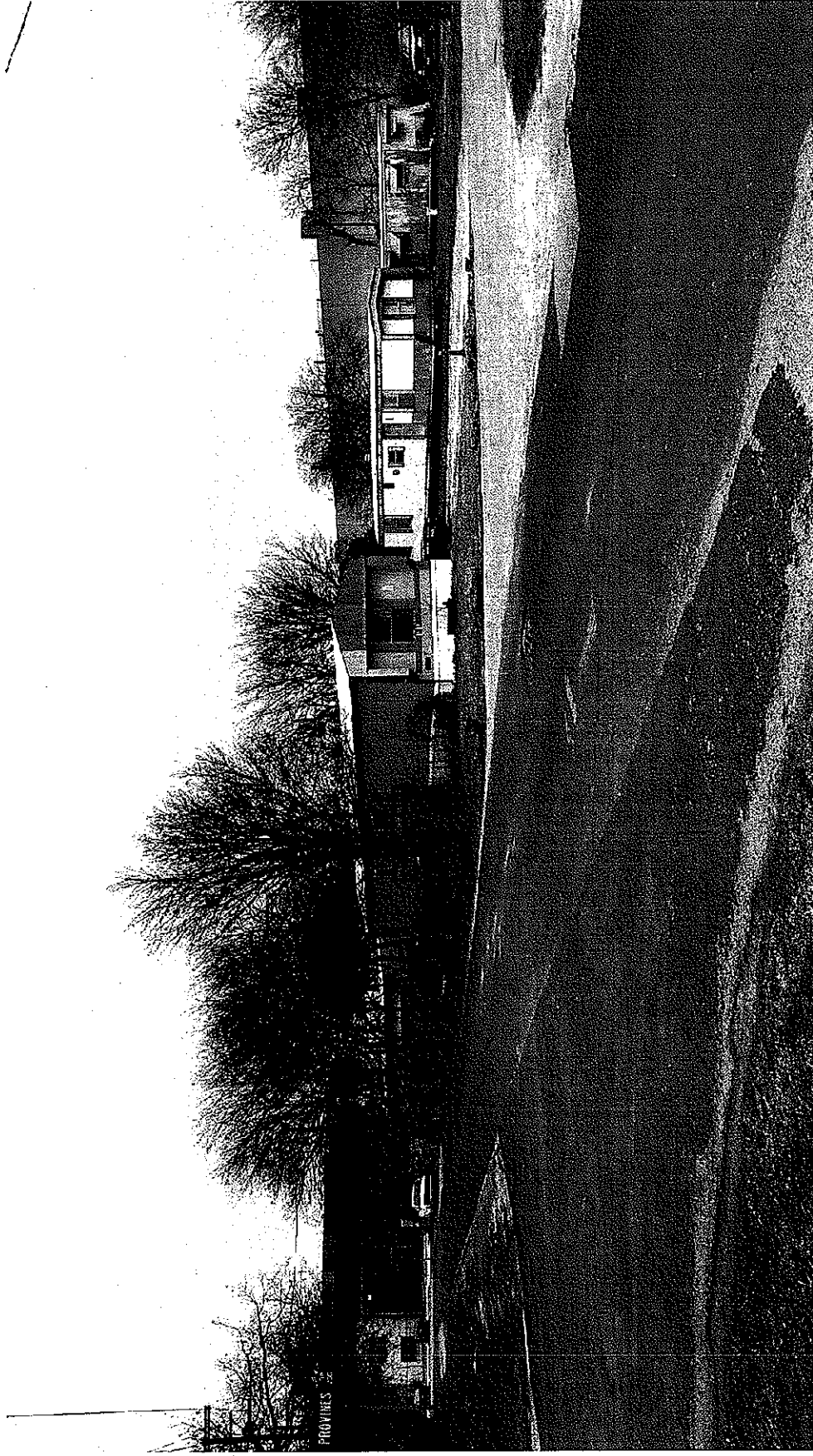
VIEW OF NORTHEAST CORNER OF PROVINES DR. & TURNER DR.