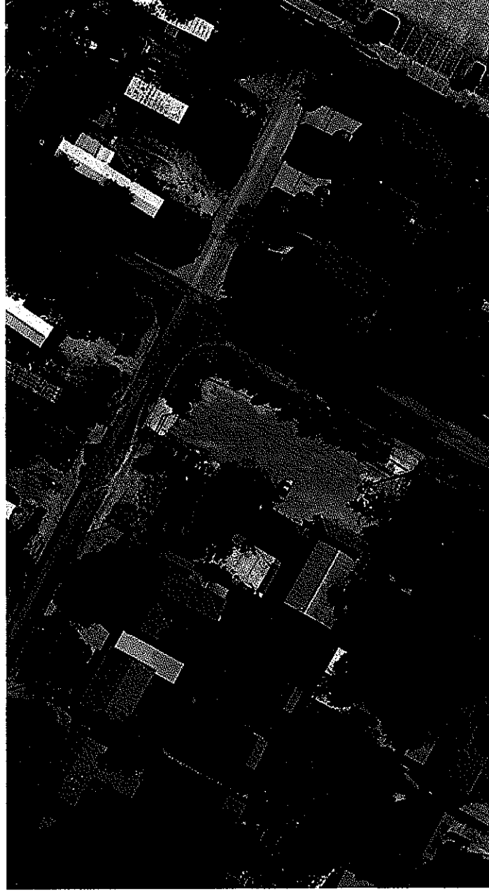
203 PROVINCES – AERIAL VIEW YR-2014