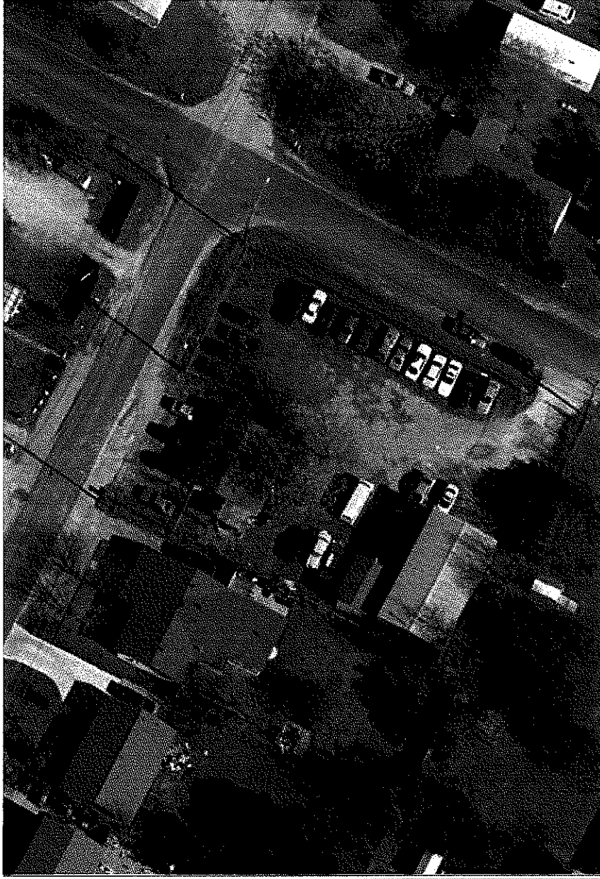
203 PROVINCES – AERIAL VIEW YR-2003