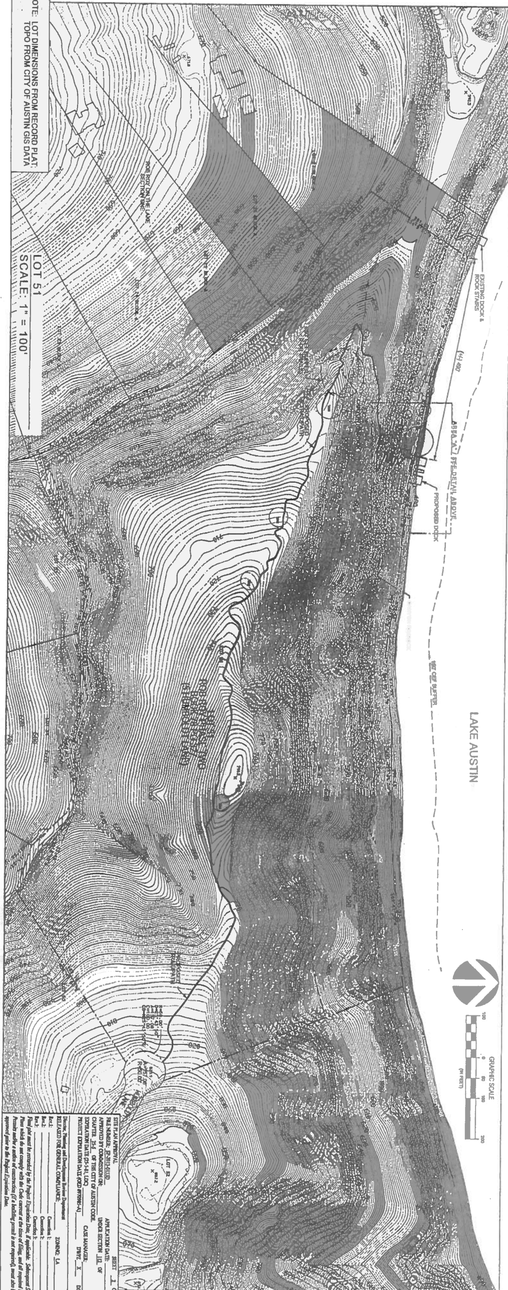
NOTE: LOT DIMENSIONS FROM RECORD PLAT TOPO FROM CITY OF AUSTIN GIS DATA