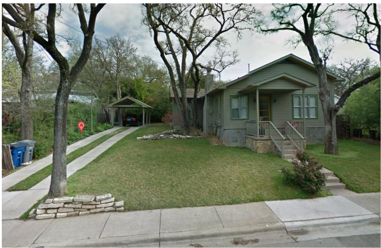
1712 W. 10^{\text{th}} \text{ Street}