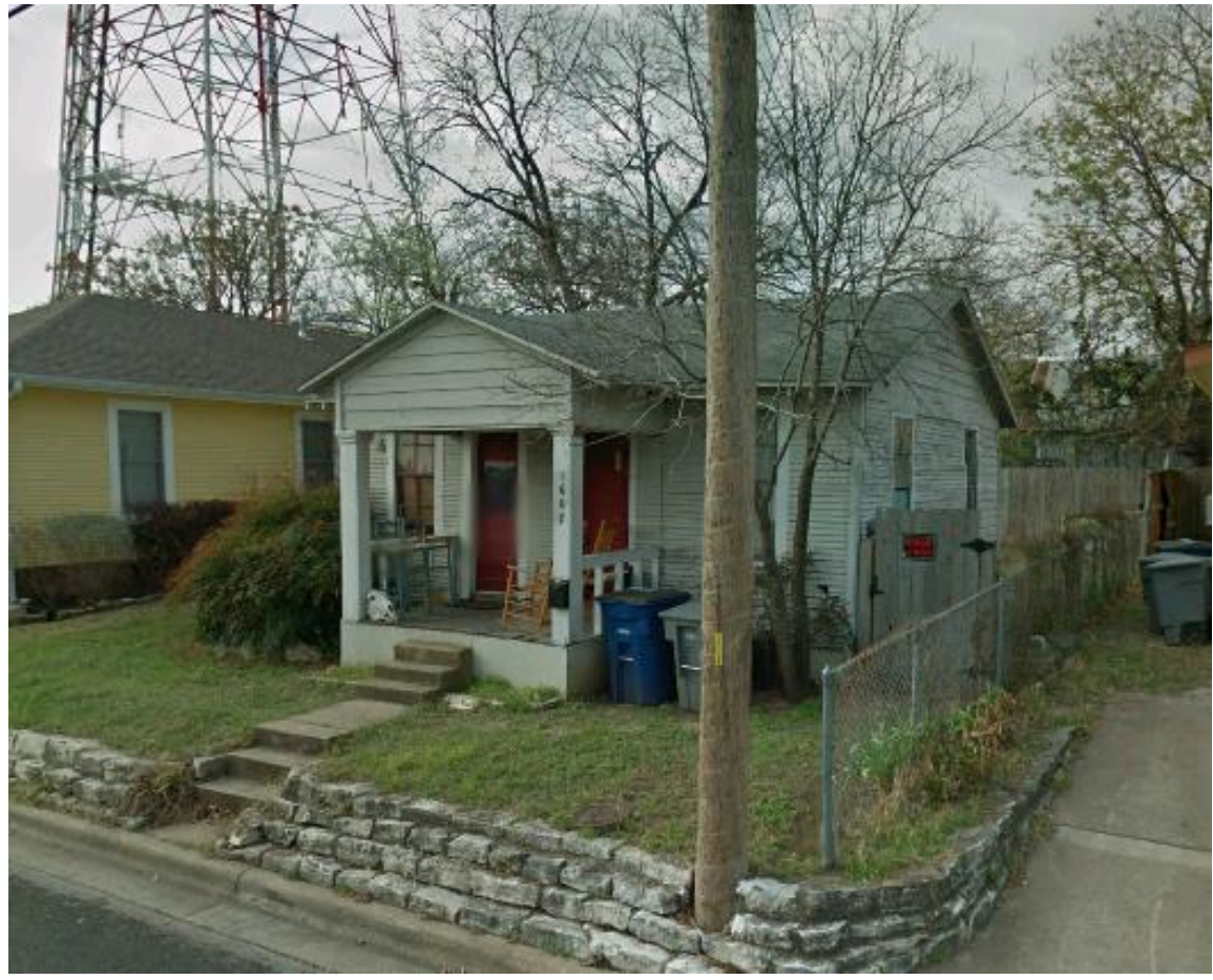
1607 W. 10<sup>th</sup> Street