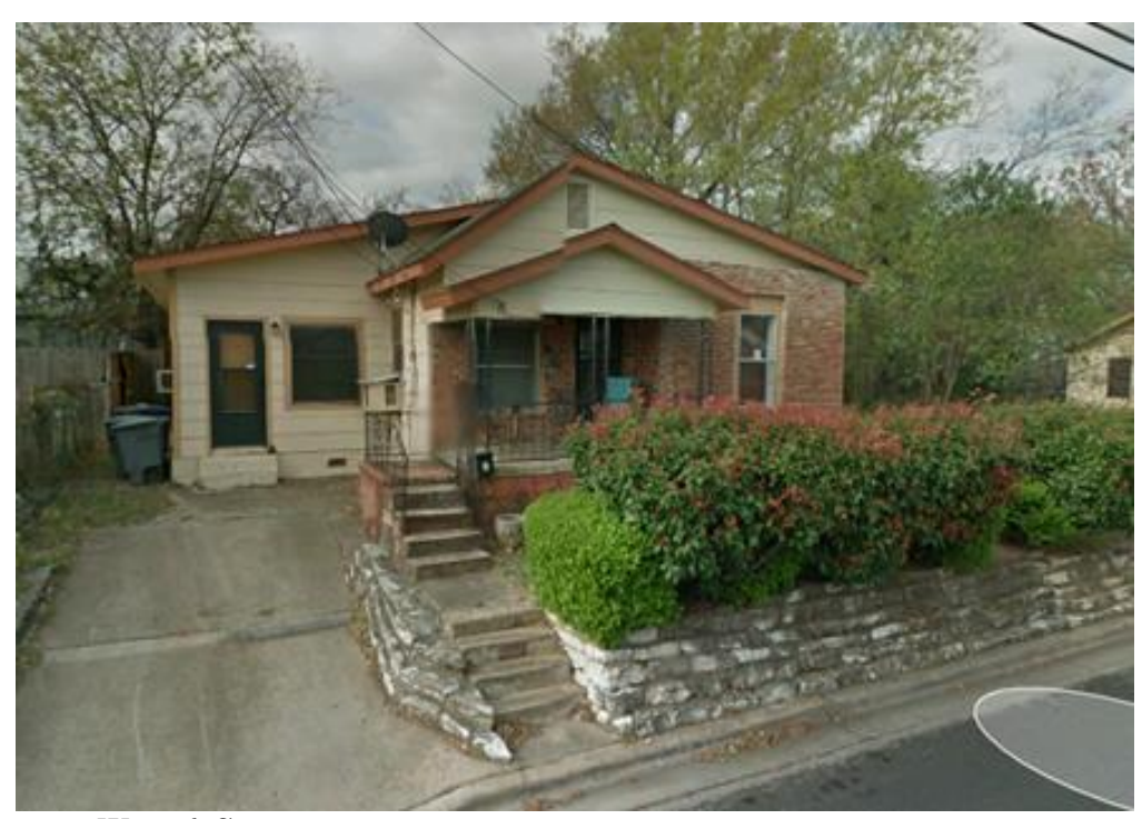
1609 W. 10<sup>th</sup> Street