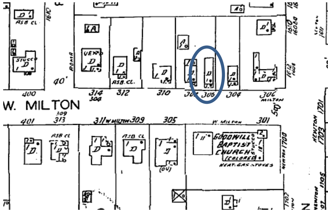
The 1962 Sanborn map shows the house on a single lot with the house formerly next door at 308 W. Milton Street.