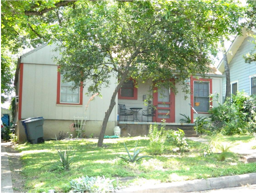
Front house – ca. 1937