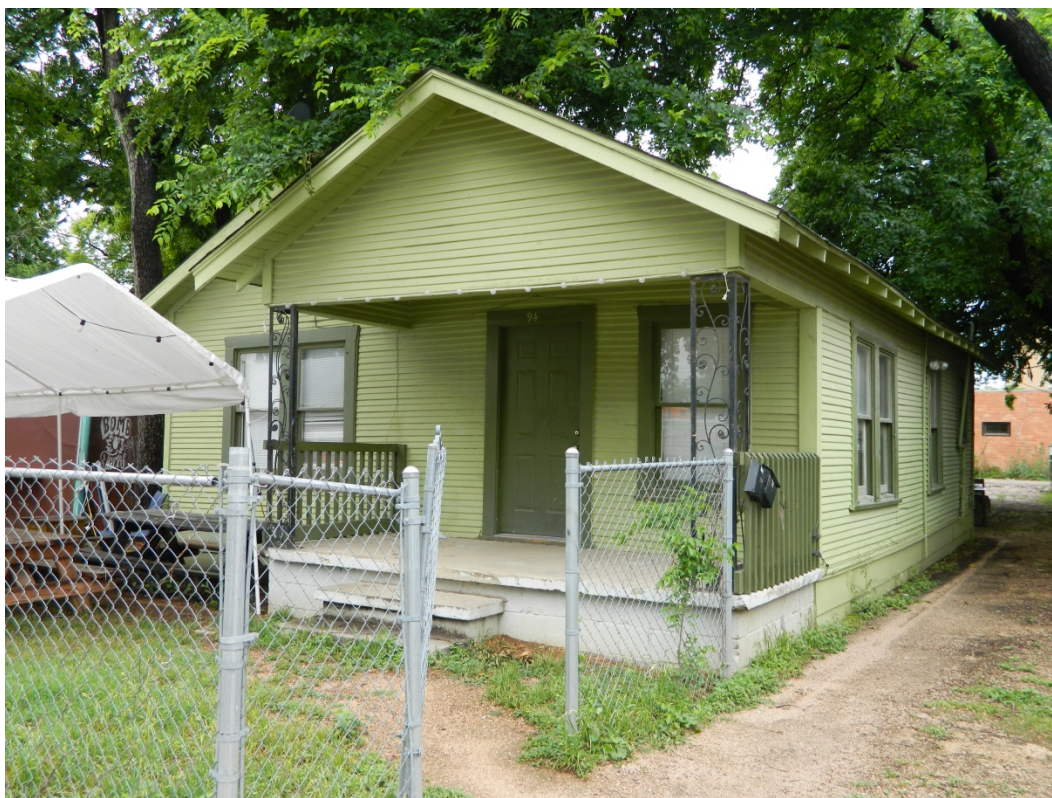
94 Rainey Street (ca. 1939)