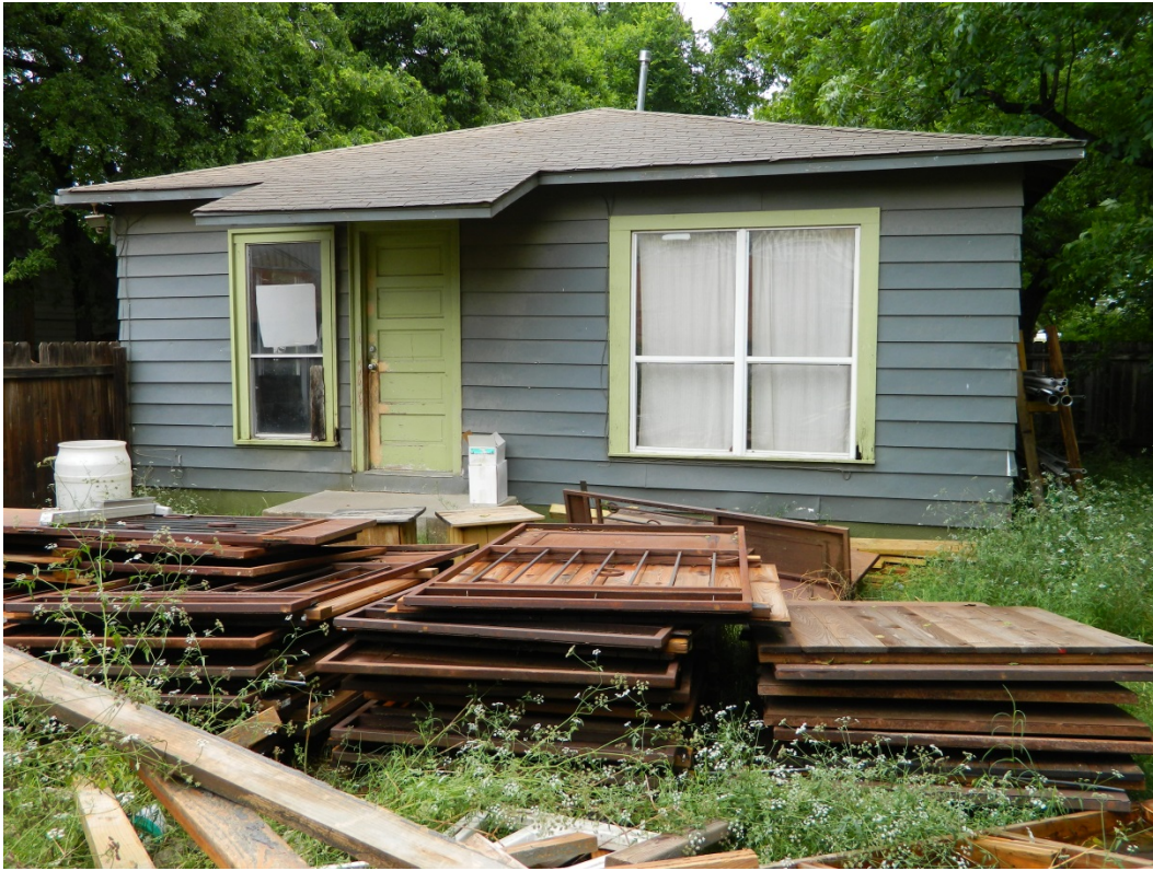
Rear house (ca. 1960) moved to the site ca. 1973 – proposed for demolition.