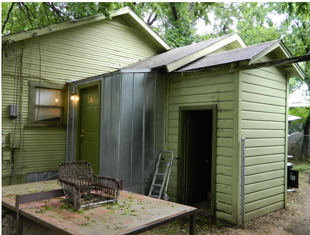
Rear addition proposed for removal