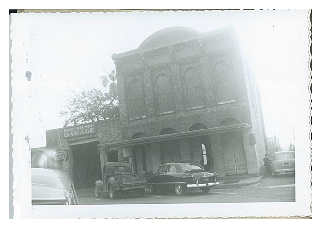
Photograph dating from the early 1950s showing the awning on the building.