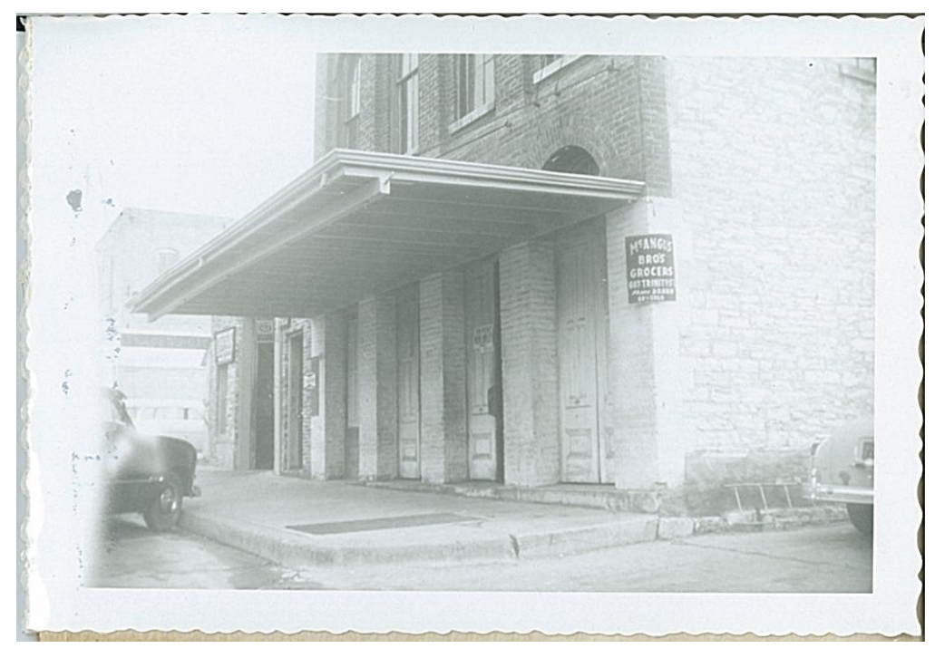
Photograph dating from the early 1950s showing the awning across the front of the building.