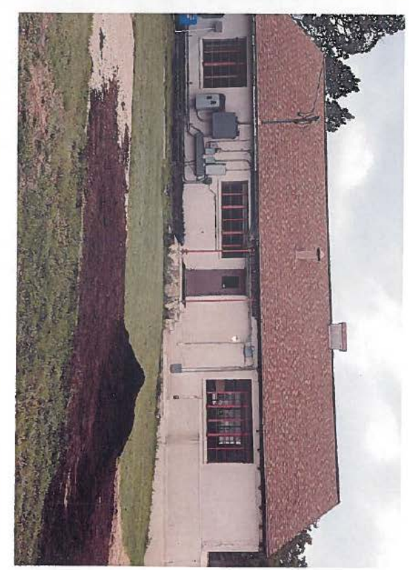
Convent building (ca. 1949)