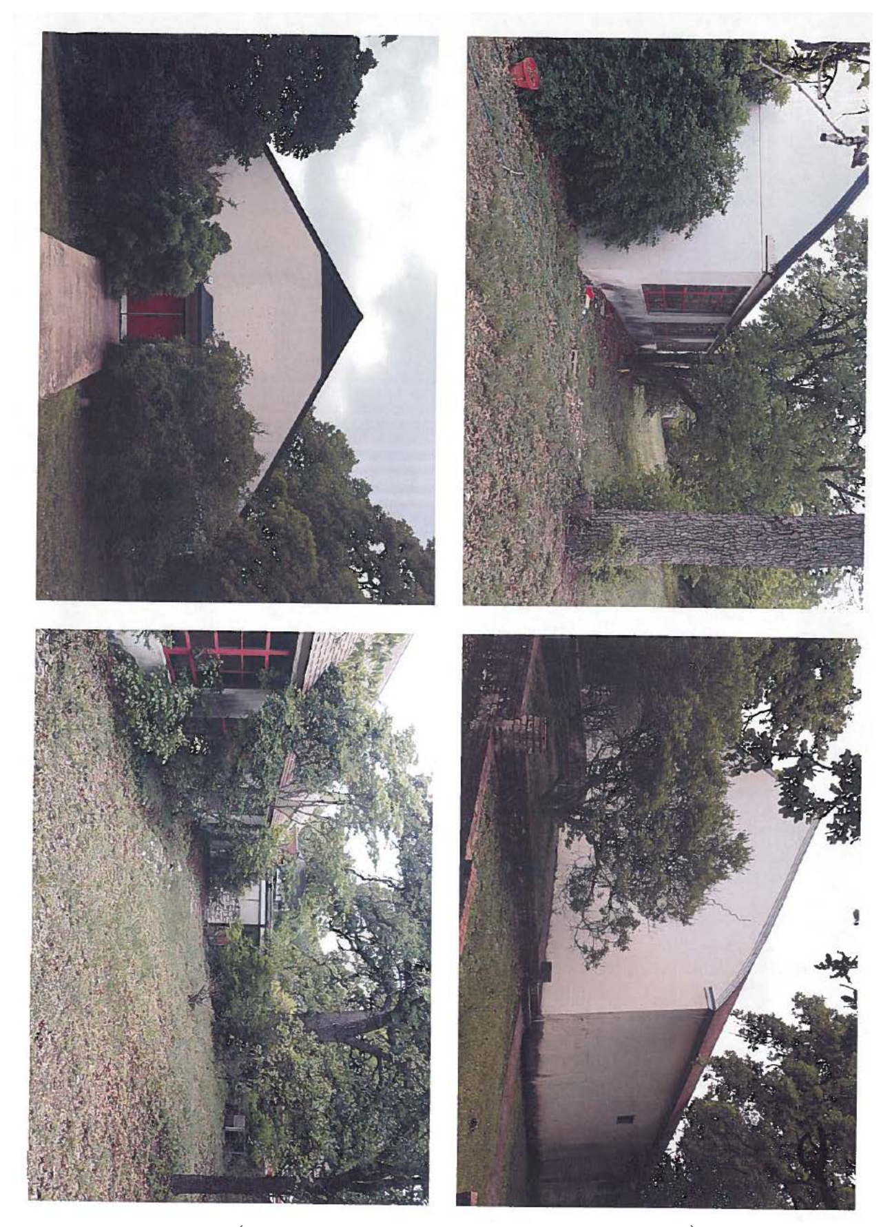
Griffin School (former St. Mary's Academy schoolroom building), ca. 1949