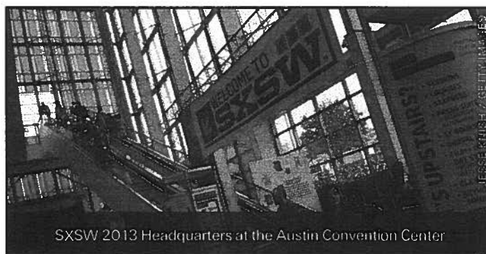
SXSW 2013 Headquarters at the Austin Convention Center

The 21st annual SXSW® Interactive Festival challenges you to envision the future of innovative technology. Featuring five days of compelling presentations from the brightest minds in emerging media and scores of exciting networking events hosted by industry leaders, SXSW Interactive offers an unbeatable line up of special programs showcasing the best new websites, digital projects, wireless applications, video games and startup ideas the community has to offer.