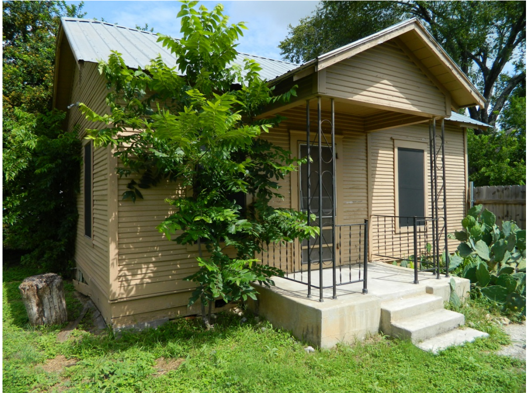
OCCUPANCY HISTORY 2911 E. 3<sup>rd</sup> Street

City Directory Research, Austin History Center By City Historic Preservation Office June, 2013