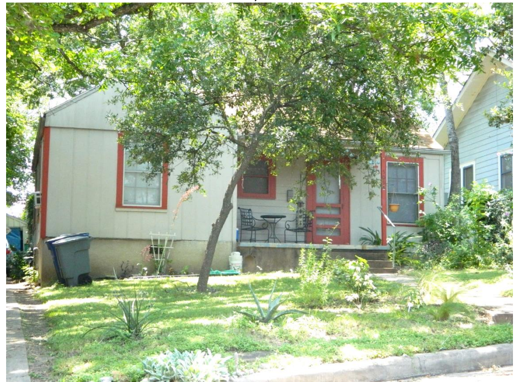
Front house - ca. 1937