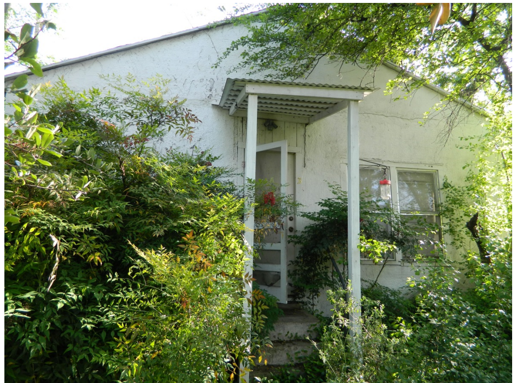
Back house – ca. 1940 OCCUPANCY HISTORY 509 Lockhart Drive