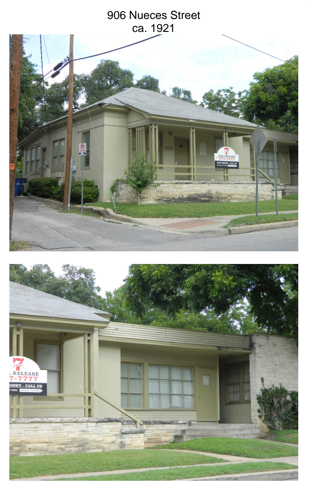
Detail showing the ca. 1951 connecting addition between the house at 906 Nueces Street and the medical office building at 601 W. 10<sup>th</sup> Street.