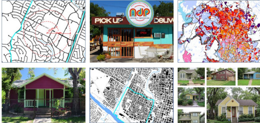
AUSTIN, TEXAS LAND DEVELOPMENT CODE DIAGNOSIS