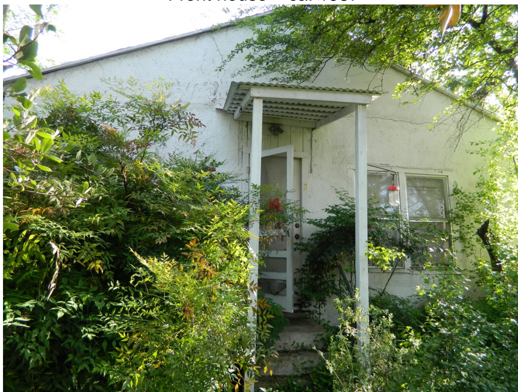
Back house – ca. 1940 OCCUPANCY HISTORY 509 Lockhart Drive