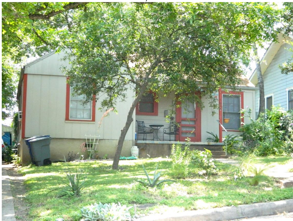
Front house – ca. 1937