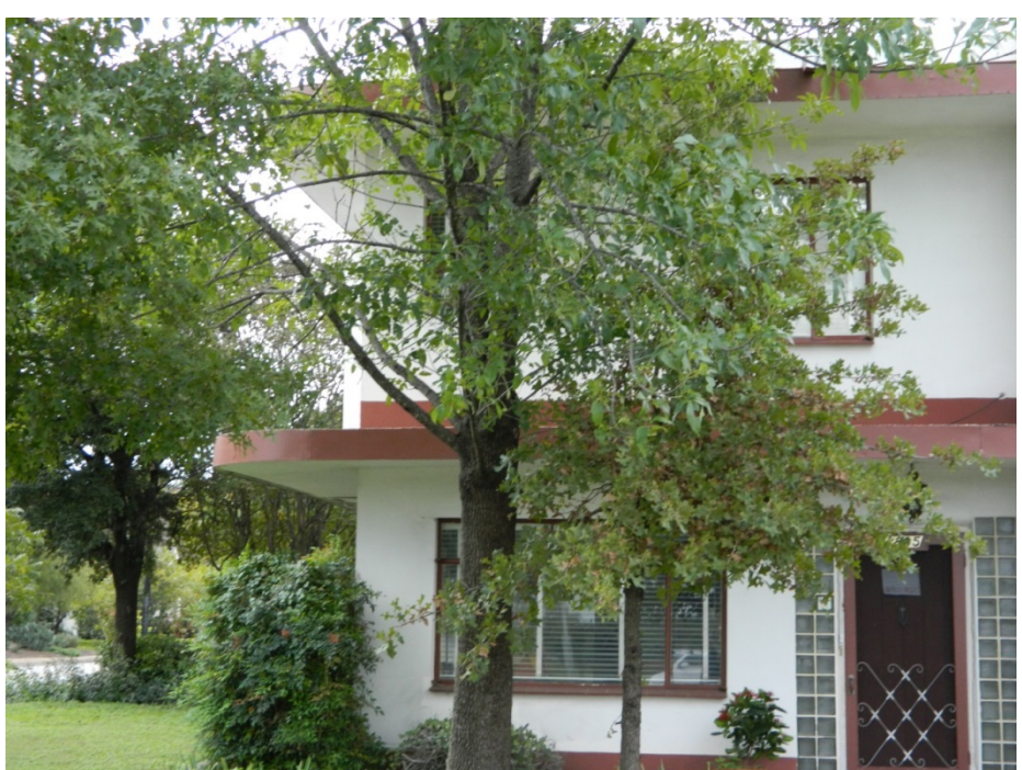
Detail showing the rounded corner of the canopies on the first floor