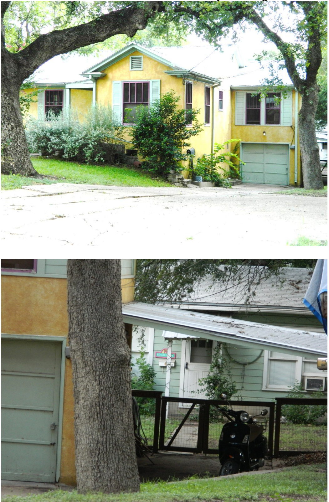
OCCUPANCY HISTORY 1106 Woodland Avenue