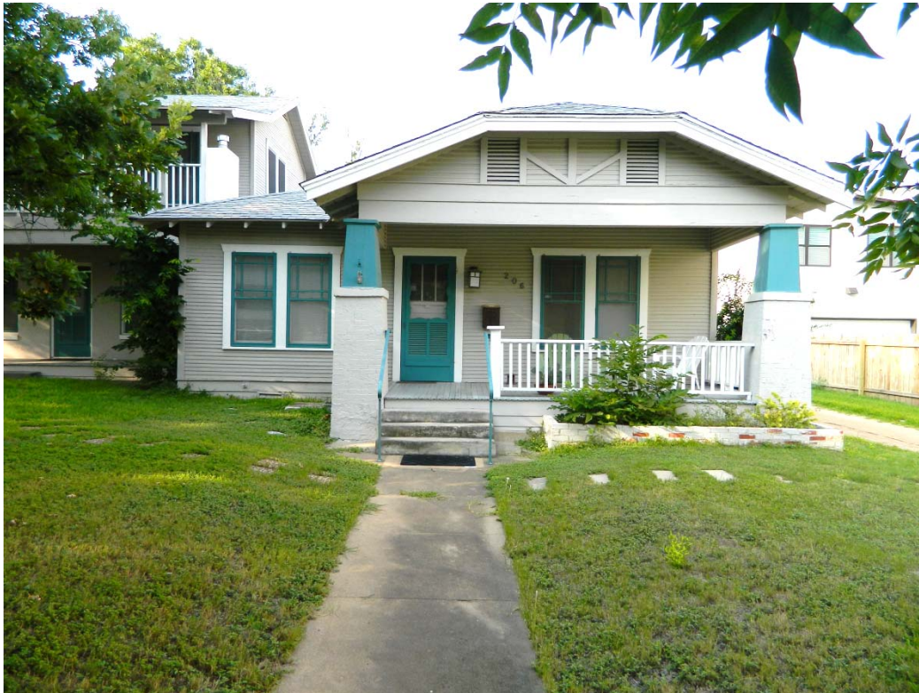
206 East Live Oak Street ca. 1926