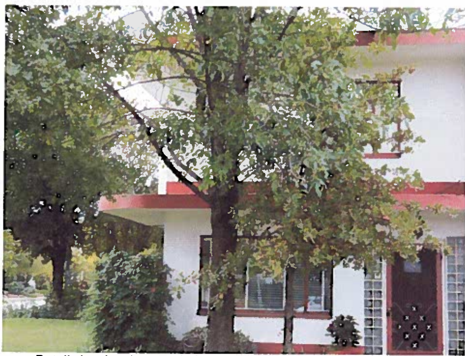
Detail showing the rounded corner of the canopies on the first floor