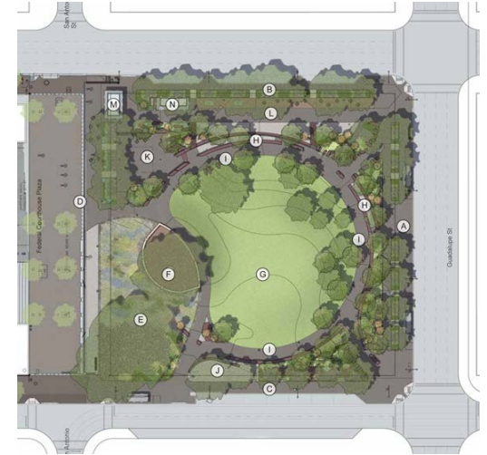
MASTER PLAN 2013