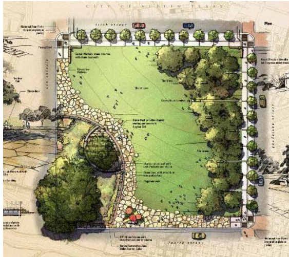
VISION PLAN 2010