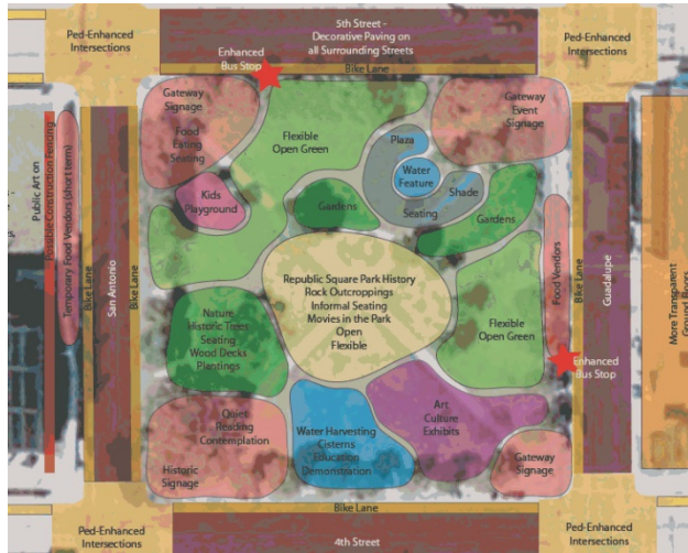
PPS VISION 2007