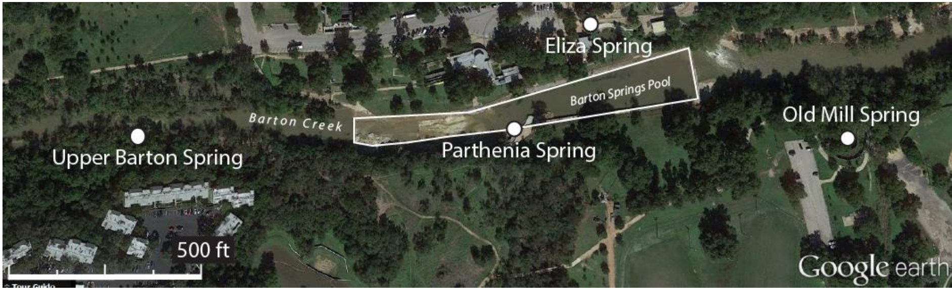
Upper Barton Spring