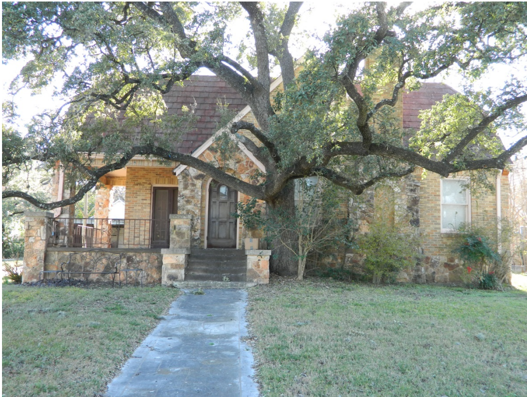
1805 Lightsey Road ca. 1932