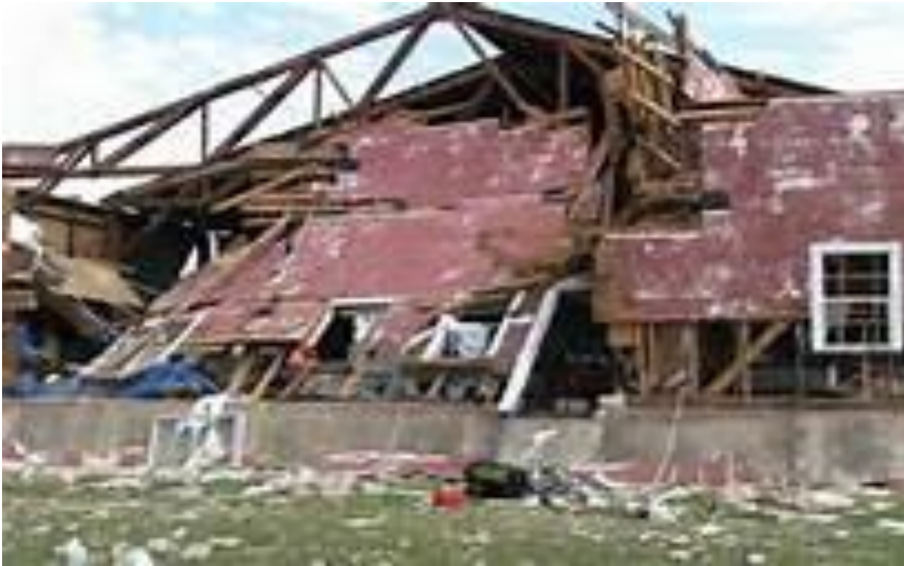
Photo of home destroyed during Hurricane Ike