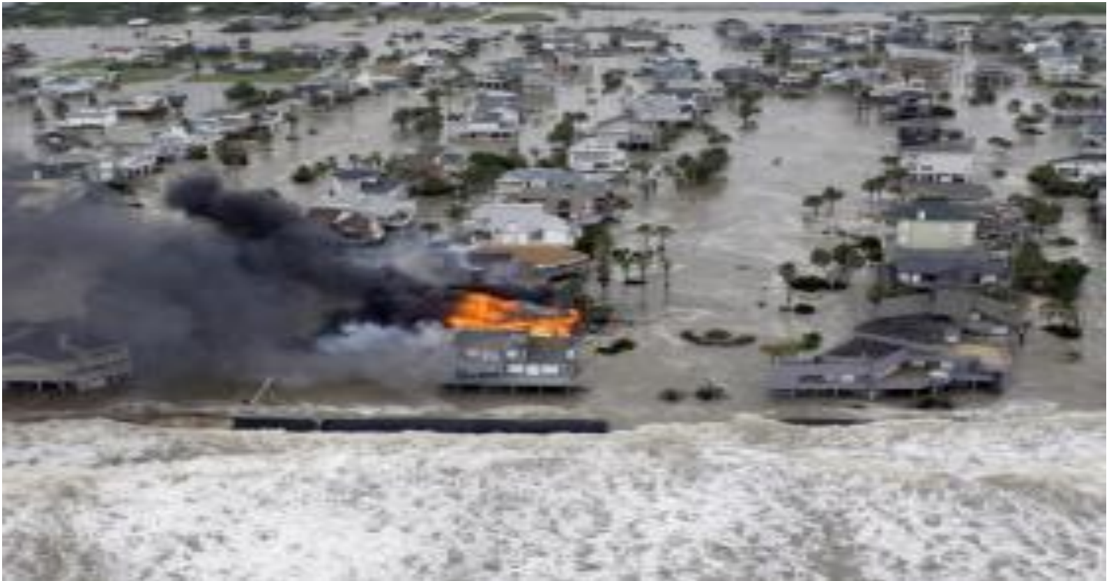
Photo of flooded Galveston coast and a home on fire surrounded by water