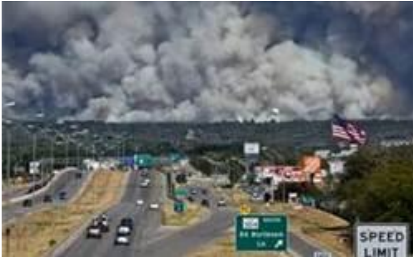
Photo of of large smoke column over state park