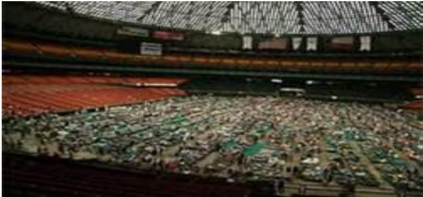
Photo of Astrodome floor level filled with cots and evacuees