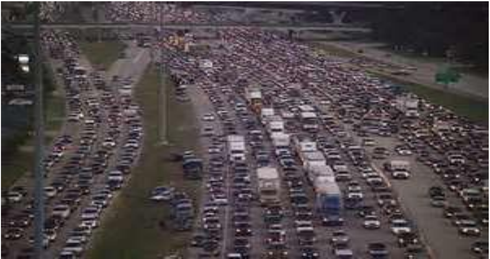
Photo of highway evacuation traffic during an evacuation