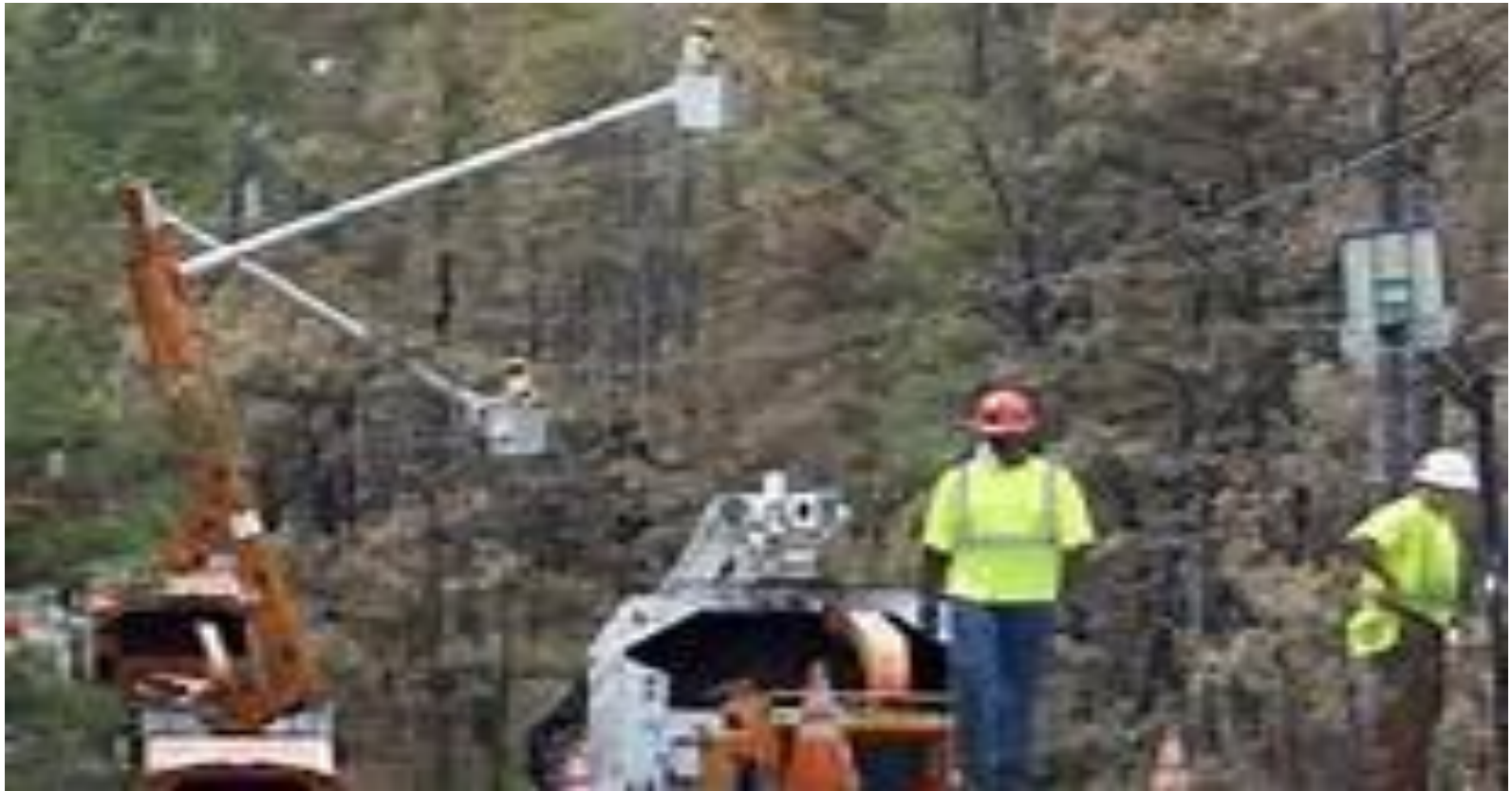
Photo of electrical workers reconnecting the electricity after the Bastrop Fire