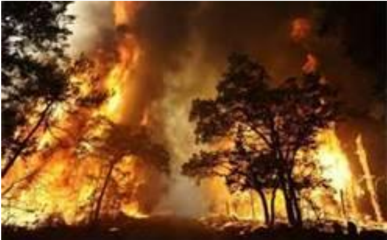
Photo of state park on fire, trees torching 40-75 feet high