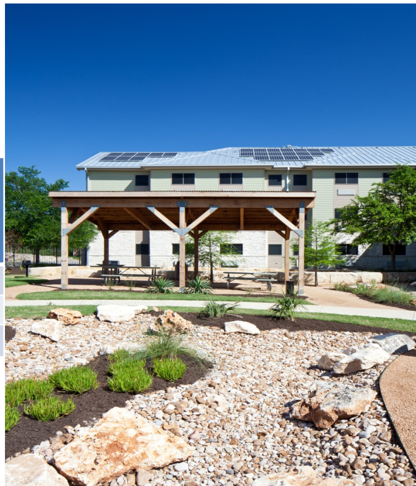
Foundation Communities Arbor Terrace Project