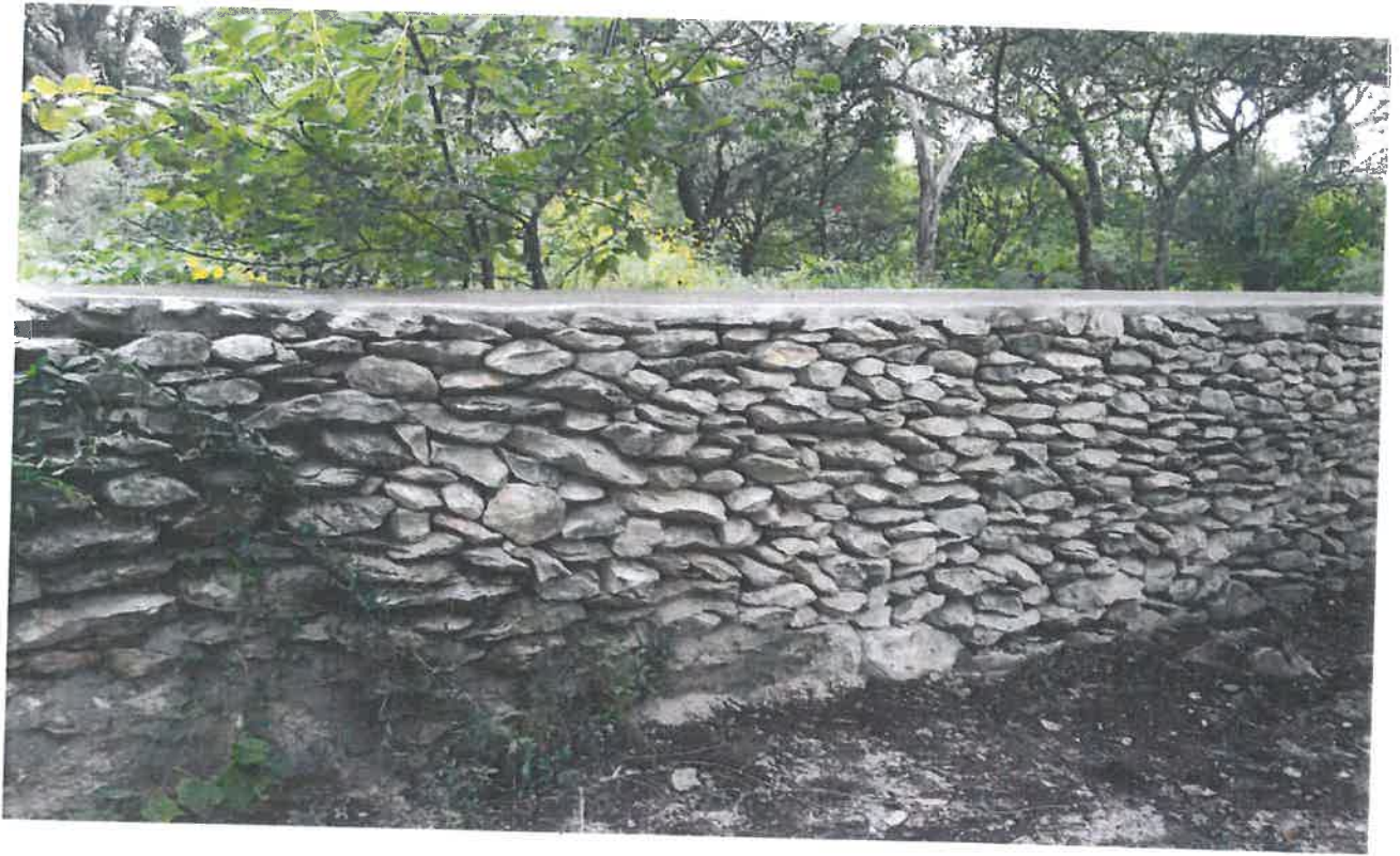
Western wall repairs completed in the fall of 2014.