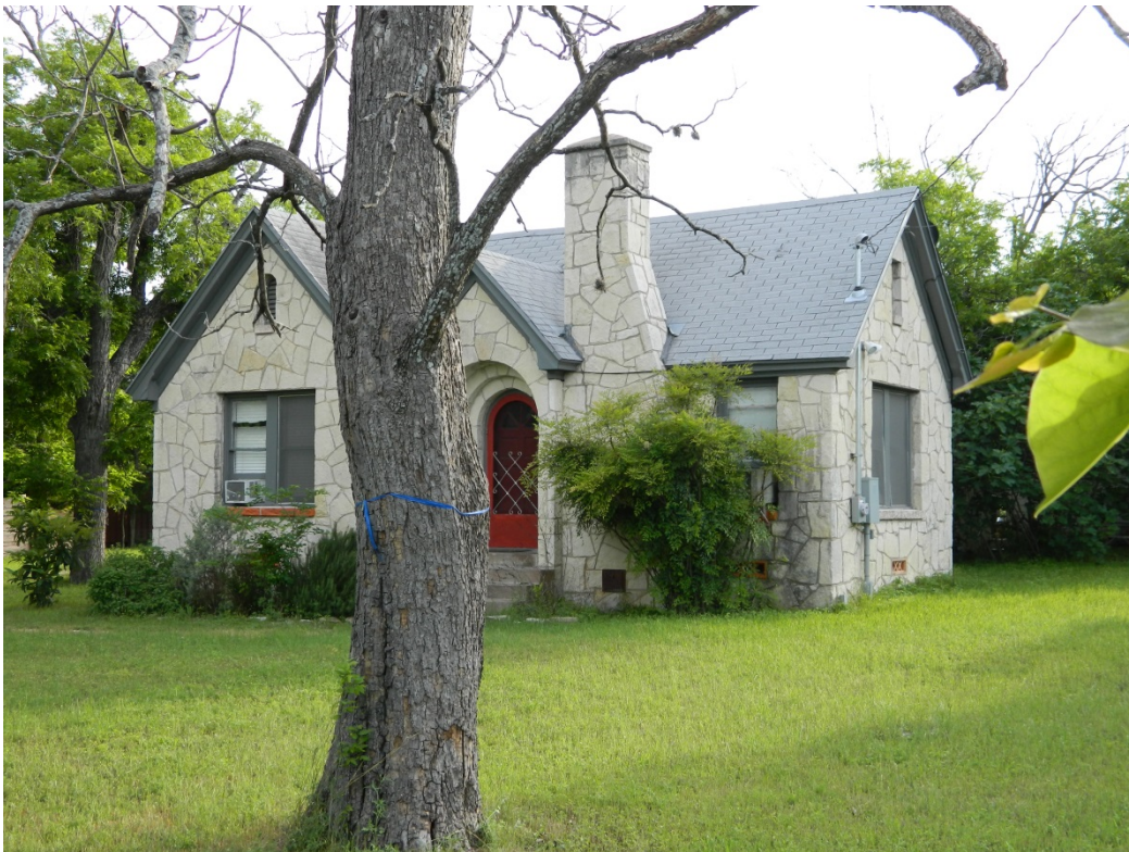
OCCUPANCY HISTORY 2102 E.M. Franklin Avenue