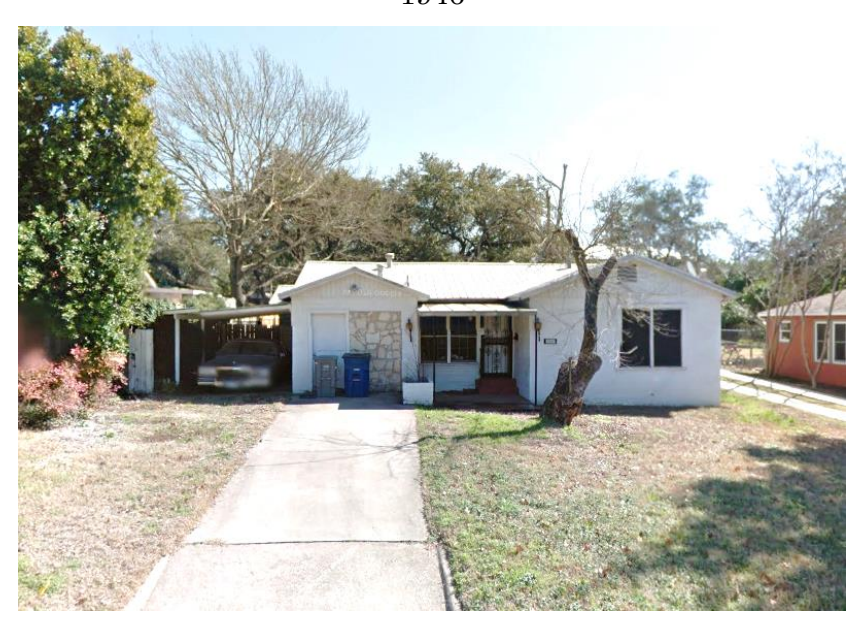
OCCUPANCY HISTORY 3209 Funston St

City Directory Research, Austin History Center By City Historic Preservation Office April, 2015