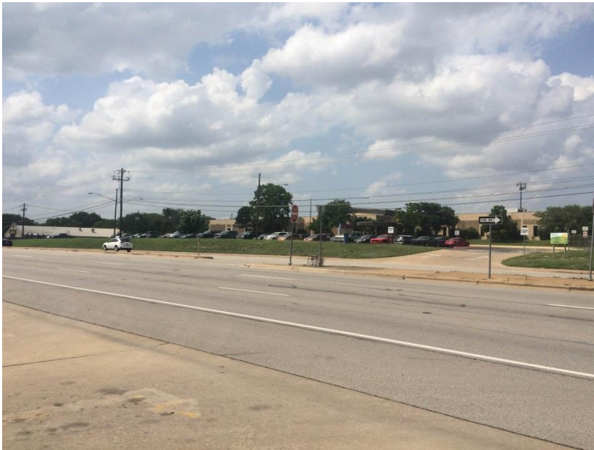
View of Parmer Lane Elementary School from proposed CVS site.

Images of proposed CVS site in relation to Parmer Lane Elementary School.