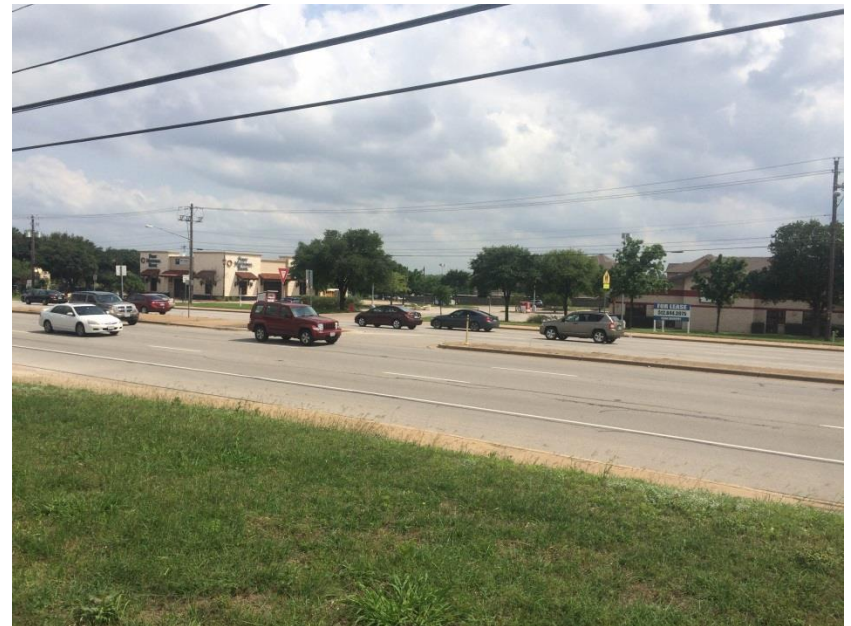
View of proposed CVS site from Parmer Lane Elementary School