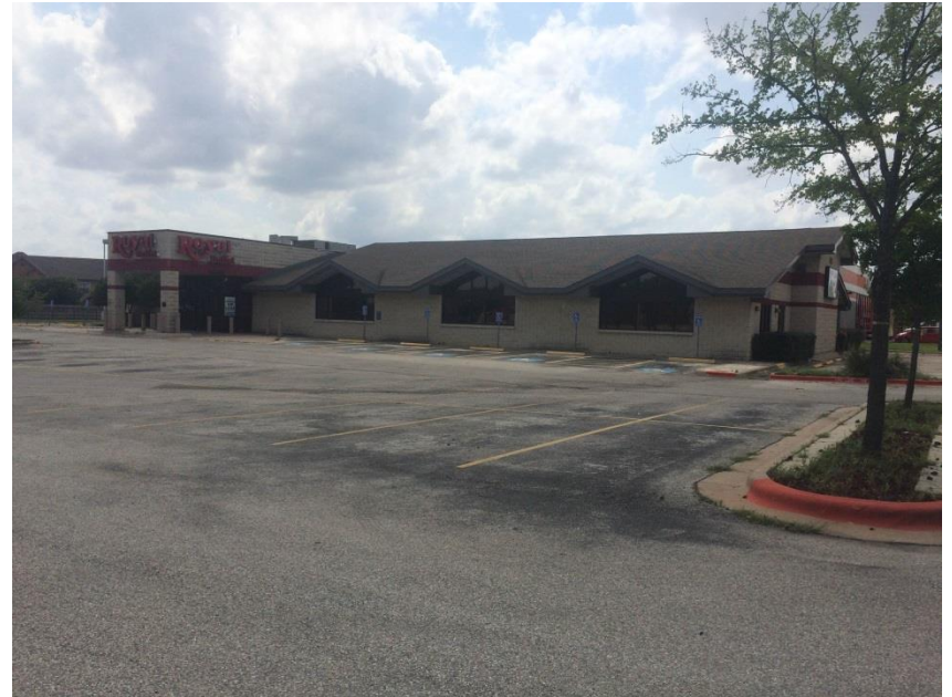
Image of existing structure on proposed waiver site (Former Royal Buffet).