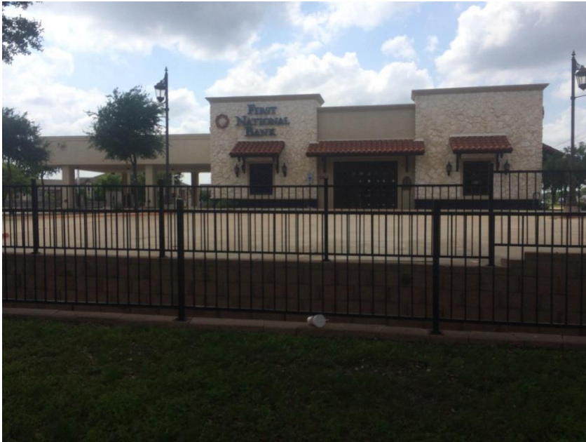
Image of existing structure on proposed waiver site (Former First National Bank)

Images of existing structures on proposed CVS site.