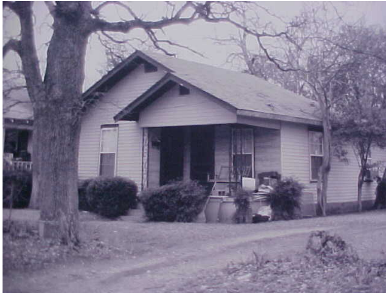
Photograph taken ca. 2000