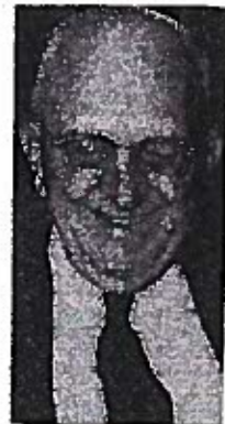
CLYDE LITTLEFIELD Secretive too.

"If you have blocking, you've got an offense. If you have speed and tackling, you have a defense."