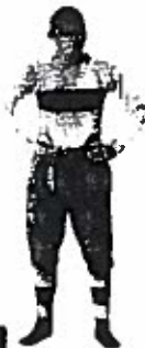
Littlefield walks the halls of fame