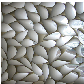
Patel_06.JPG Looking Through , 2007 Hamtramack, MI 36''w x 72''h x 14''d Paper