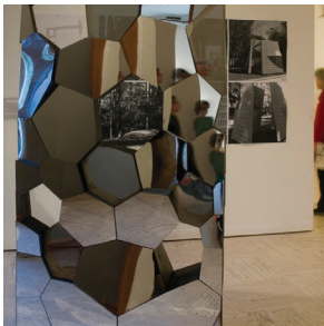
Patel_04.JPG Mirror Wall, 2008 Berlin, Germany 4'w x 9'h x 18''d Laser-cut acrylic mirror, Airplane Plywood.