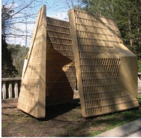
Patel_03.JPG Garden Pavilion: Topographic Geometries, 2007, Bloomfield Hills, MI 12' w x 24' l x 10' h Cnc-cut marine grade plywood