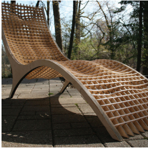
Patel_08.JPG Chaise Lounge, 2006 Birmingham, MI 36" w x 36" h x 72" l Laser cut airplane plywood