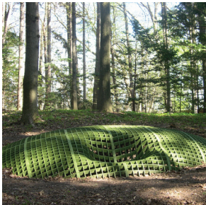
Patel_05.JPG Forest Bench, 2007 Bloomfield Hills, MI 12' w x 16' l x 4' h Cnc-cut marine grade plywood with oil based stain