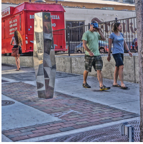
Patel_01.JPG Crystalline, 2014, Phase 2 expected completion January 2016 Austin, TX 72'h x 18''w x 18''d Polished Stainless Steel Eight polished stainless steel for streetscape project.