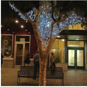
Patel_02.JPG Radiant Topiary, 2010 Austin, TX 30'h x 15' diameter Oak Trees, Gold Aluminum Foil, Paper, LED's