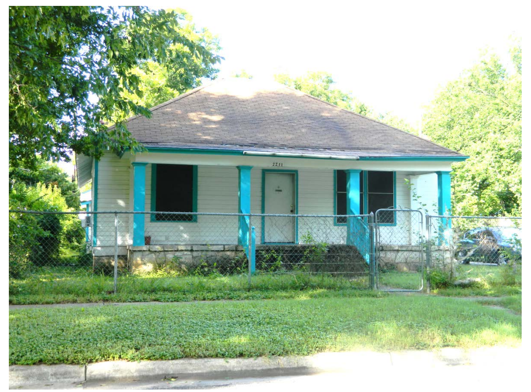
OCCUPANCY HISTORY 2211 Willow Street