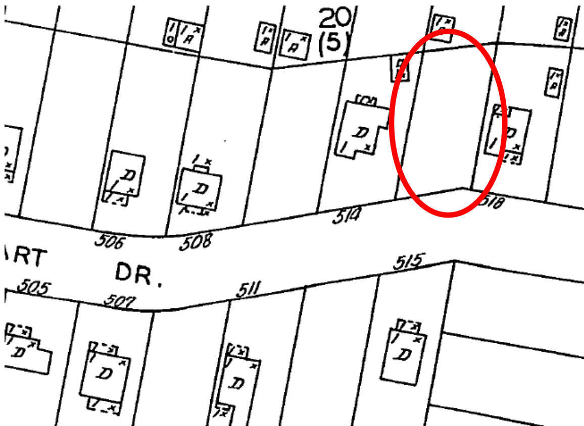
The site of the house is shown as a vacant lot on the 1935 Sanborn map.