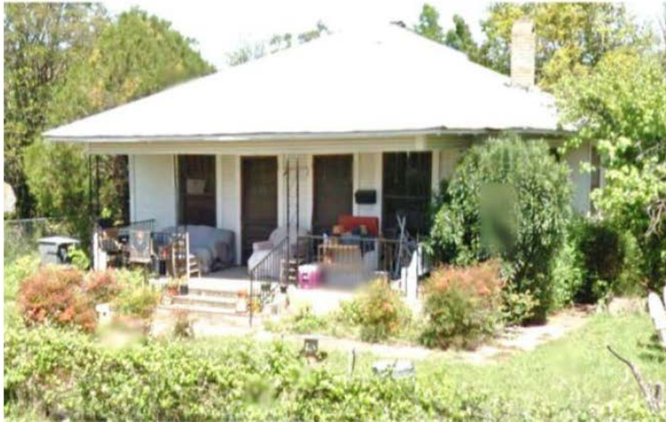
1611 Walnut, Fall 2014; To the south (right) of the house lay a side yard with chairs set up for neighbors and friends to gather.

When this case was initially heard by the HLC on January 26, 2015, staff recommended to postpone the case or initiate a historic zoning case :