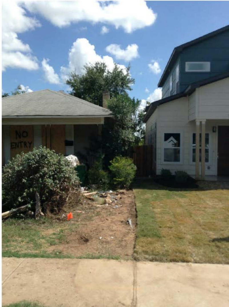
1925 house that MX3 agreed to preserve to the left; new MX3 homes on the newly subdivided half of the original lot to the right.