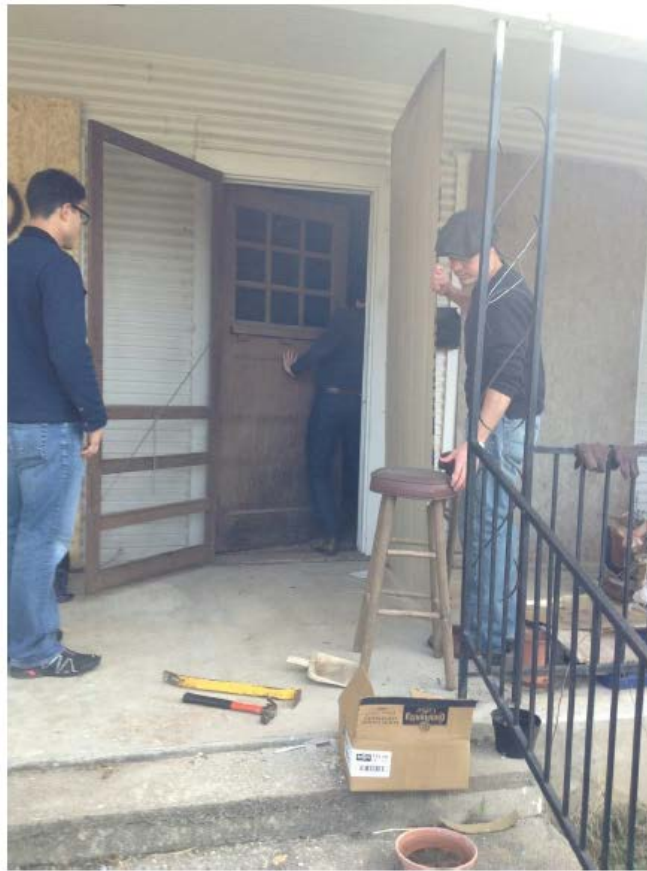
Chestnut NPCT members, supervised by an MX3 liaison, use a crowbar to open the boarded up residence for inspection.

Since the windows were boarded, it was difficult to photograph the interior. It was clear, however, that much of the original architecture remained, was in good shape, and would be worth preserving to maintain the historic character of the neighborhood and respect the history of the house and its former residents. The MX3 representative agreed, so multiple neighborhood meetings were held for discussion and, via several email exchanges, a compromise was arrived at and approved it by unanimous vote at the Chestnut NPCT meeting on March 8, 2015 [minutes] :