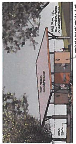
3 SOUTH ELEVATION 1/8" = 1'-0"