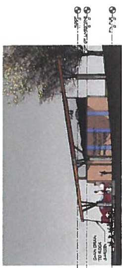
4 EAST ELEVATION 1/8" = 1'-0"