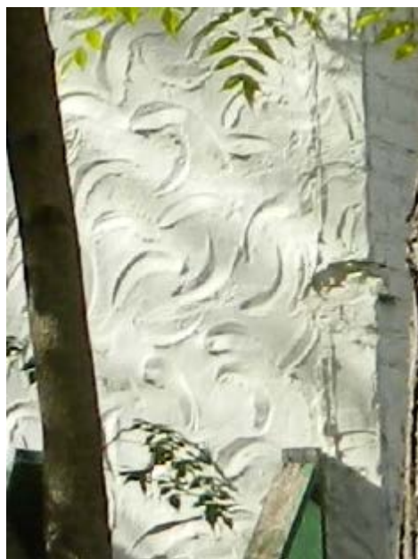
Details of the palm-plastered exterior of the house