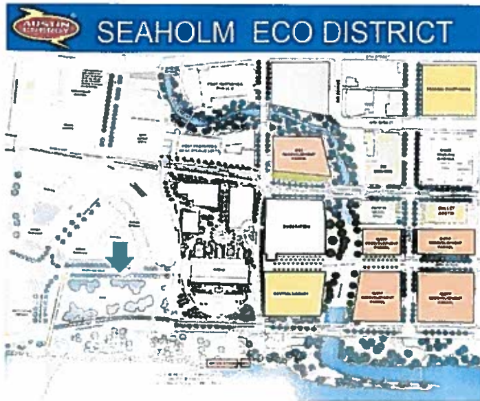
Map of the Seaholm EcoDistrict with the indicated position of a DC Fast Charger on the future Electric Drive