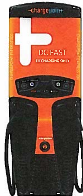
DC Fast chargers can fully recharge vehicles within minutes