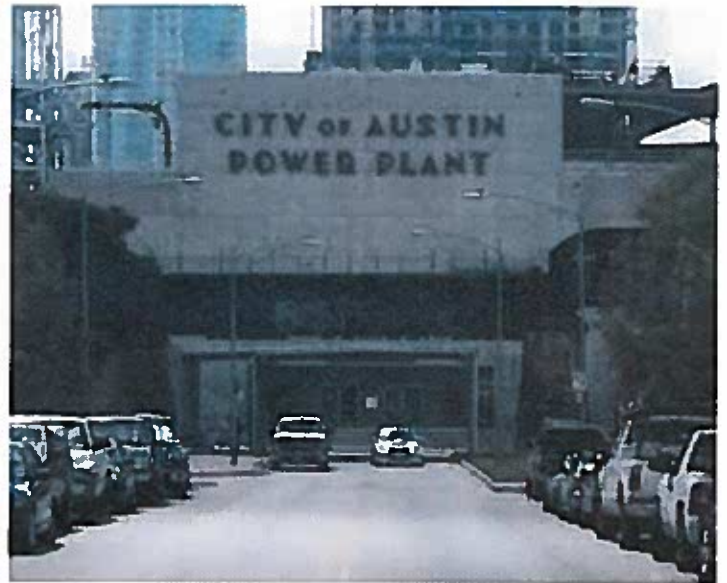
Photo of future Electric Drive in Seaholm EcoDistrict