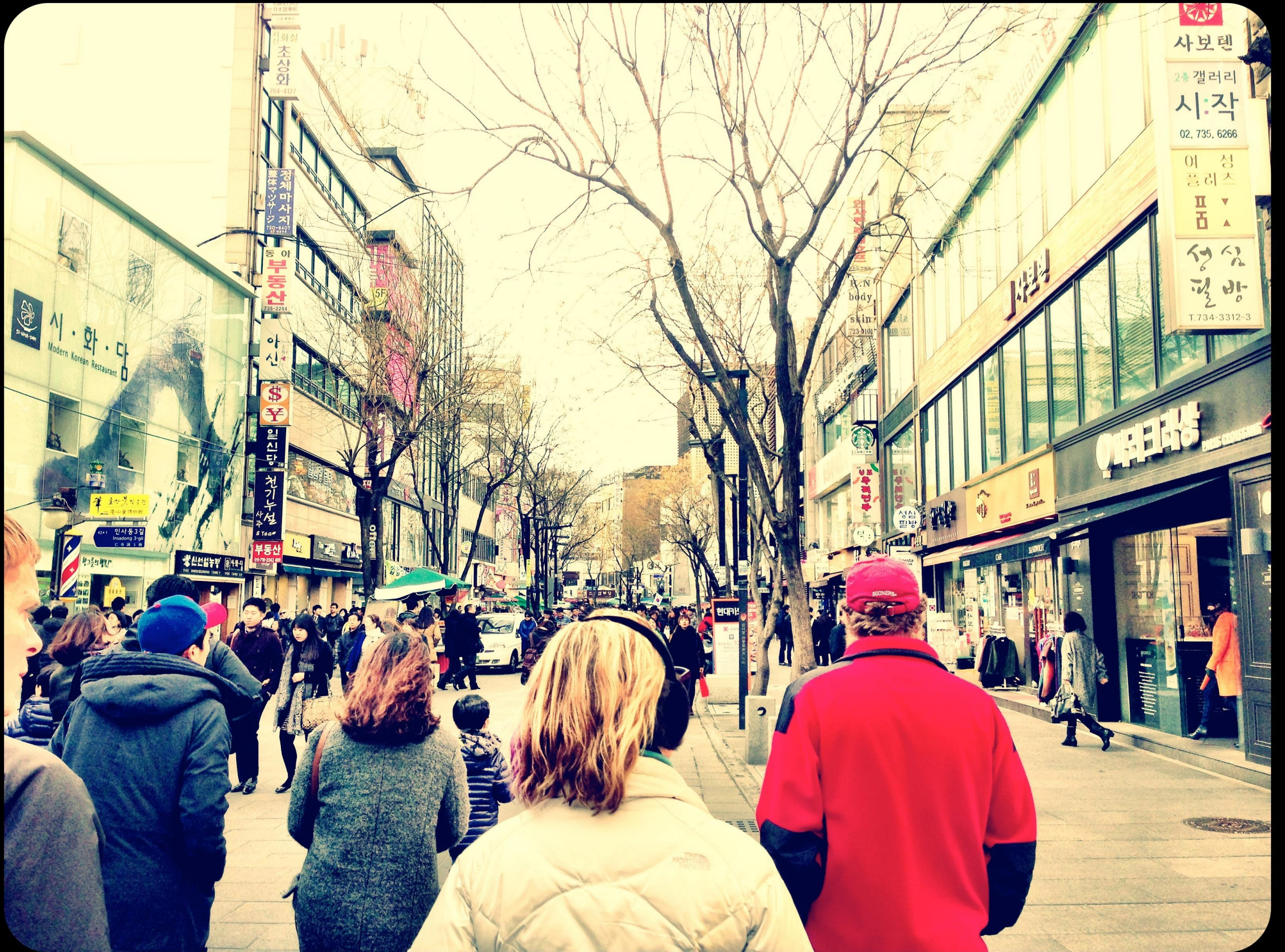
Seoul, South Korea