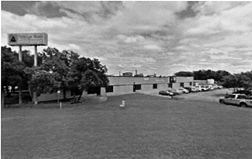
15811 Vision Dr Pflugerville, TX 78660