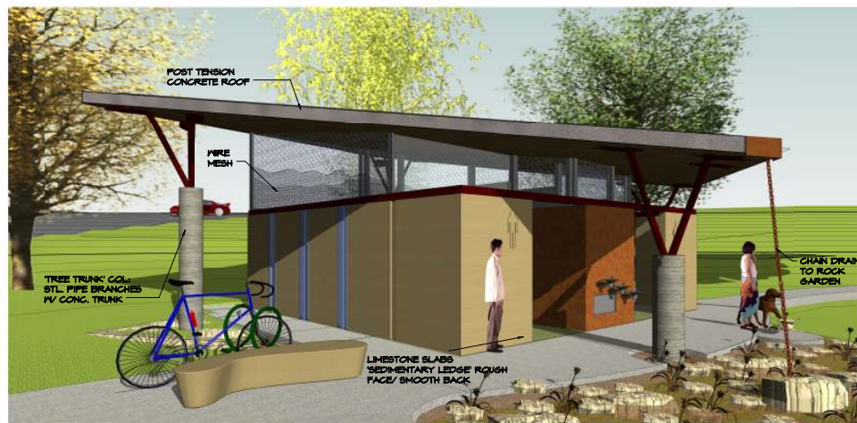
VIEW FROM TRAILHEAD