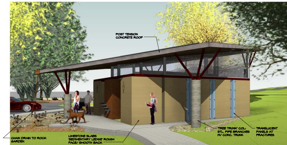
VIEW FROM HILLSIDE THEATRE