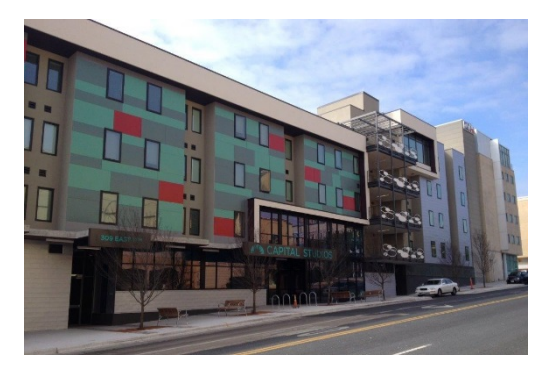
Capital Studios (Land Acquisition)