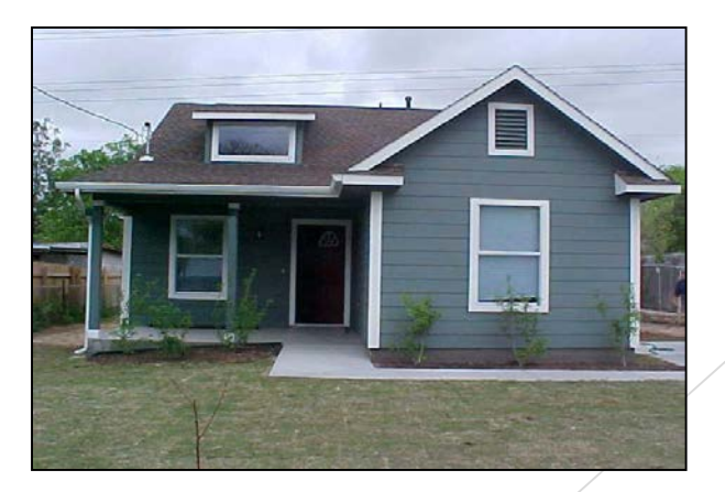
After - Hope Repair Loan Program