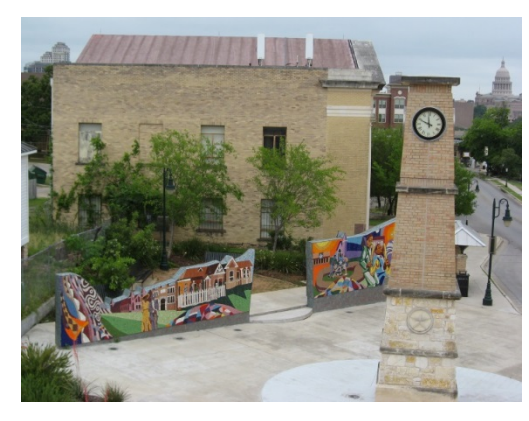
East 11<sup>th</sup> Street Revitalization