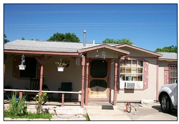
Before - Hope Repair Loan Program