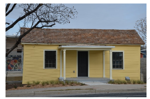
Dedrick-Hamilton House (Historic Preservation)