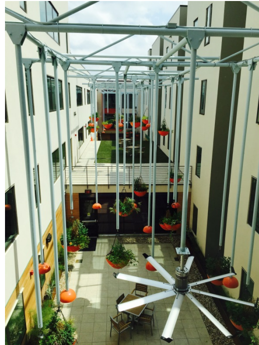
Image: Capital Studios – affordable housing development in Austin, Texas.