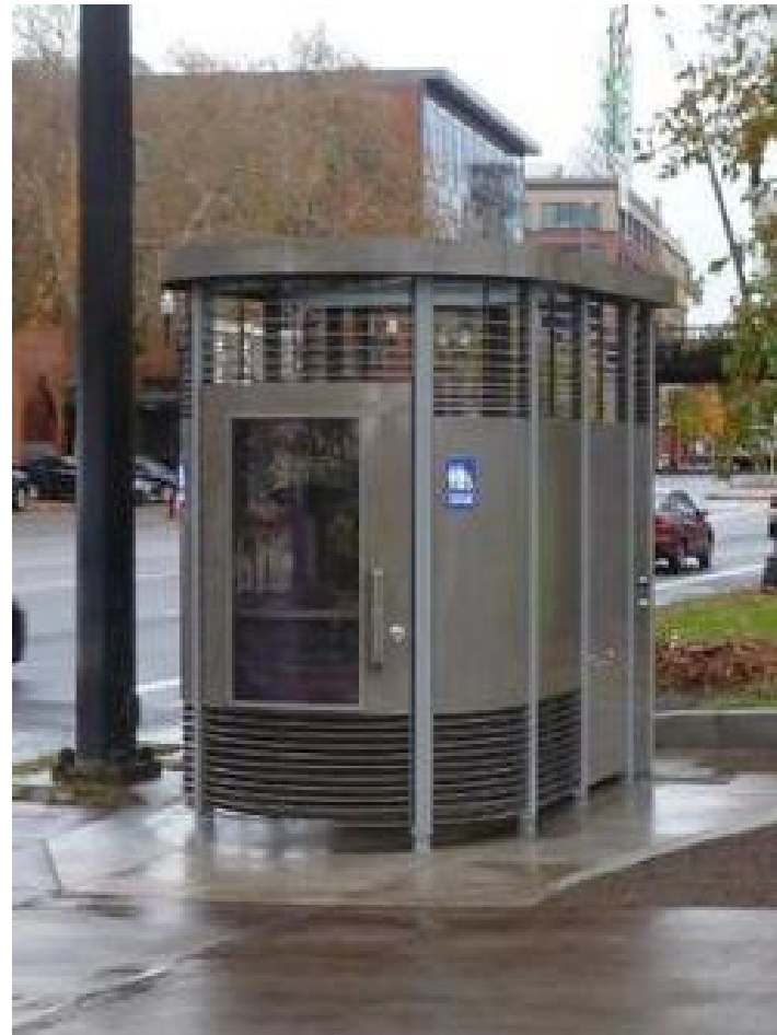
The Portland Loo