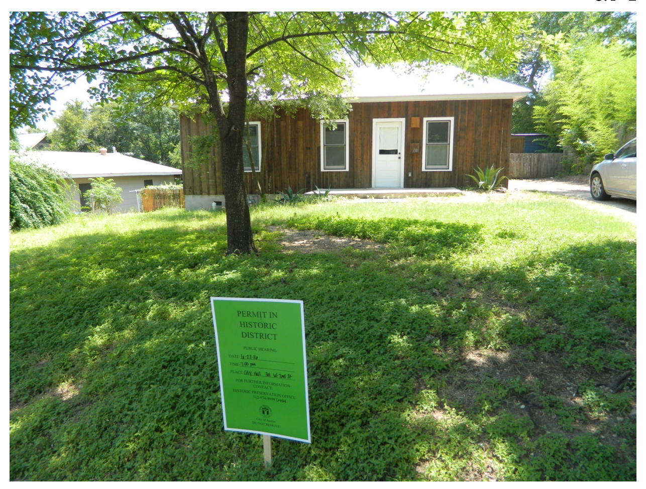
View of the house preserved by the applicant. The proposed new house will be to the left and behind this house.