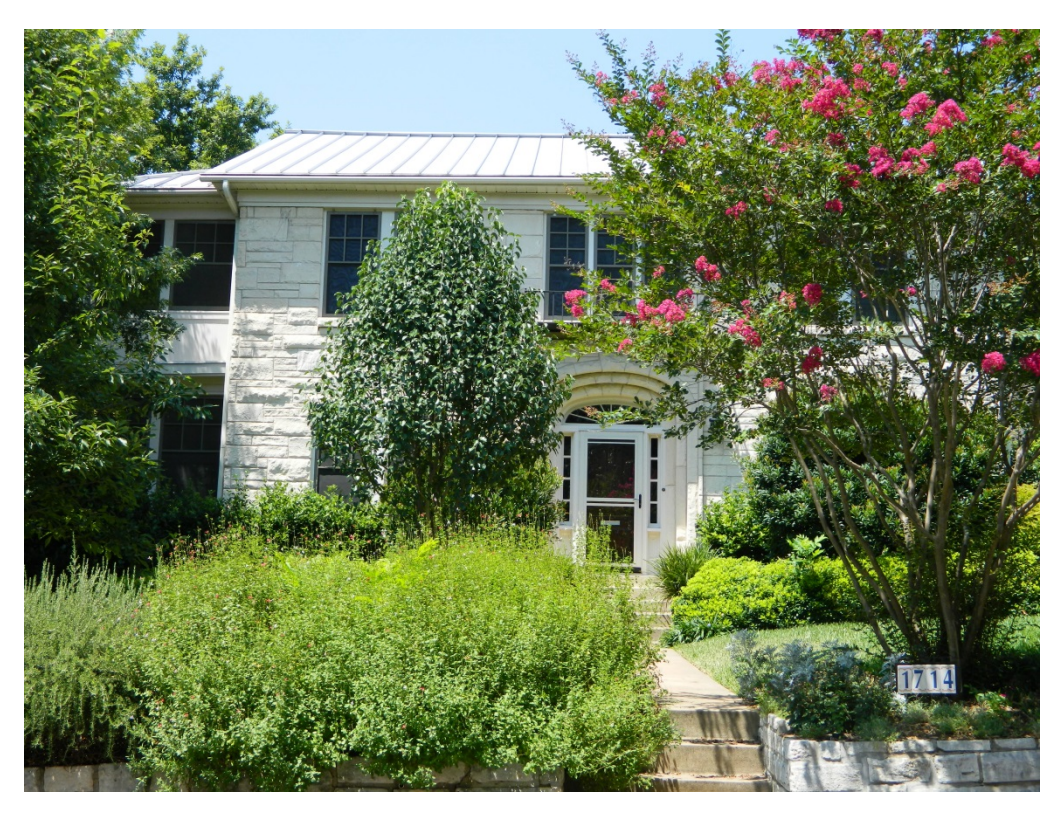
OCCUPANCY HISTORY 1714 Cromwell Hill