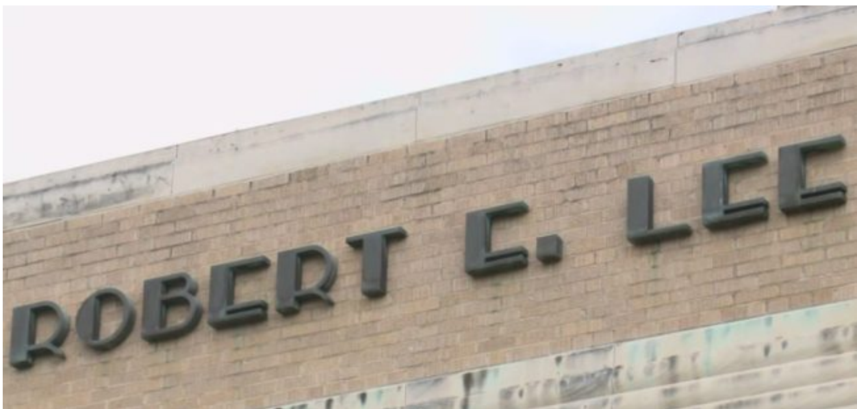
Art Deco-style lettering on the school