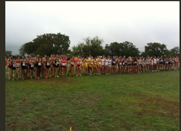
Cross Country Running Events at Hancock,