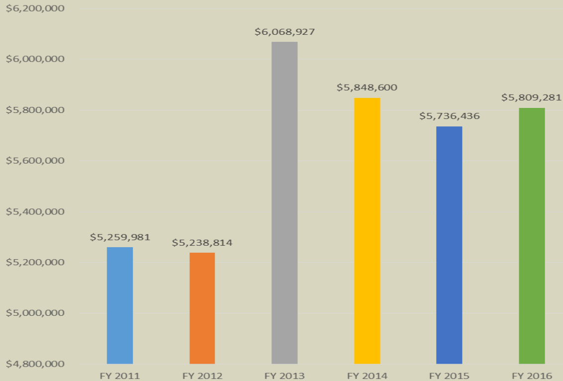
PARD Golf Division Total Revenues