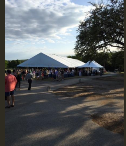
Lions Special Events