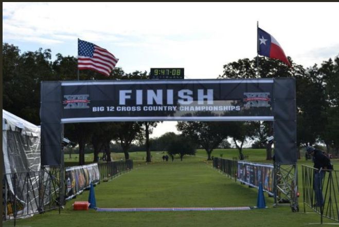
Jimmy Clay Hosted Big 12 Cross Country