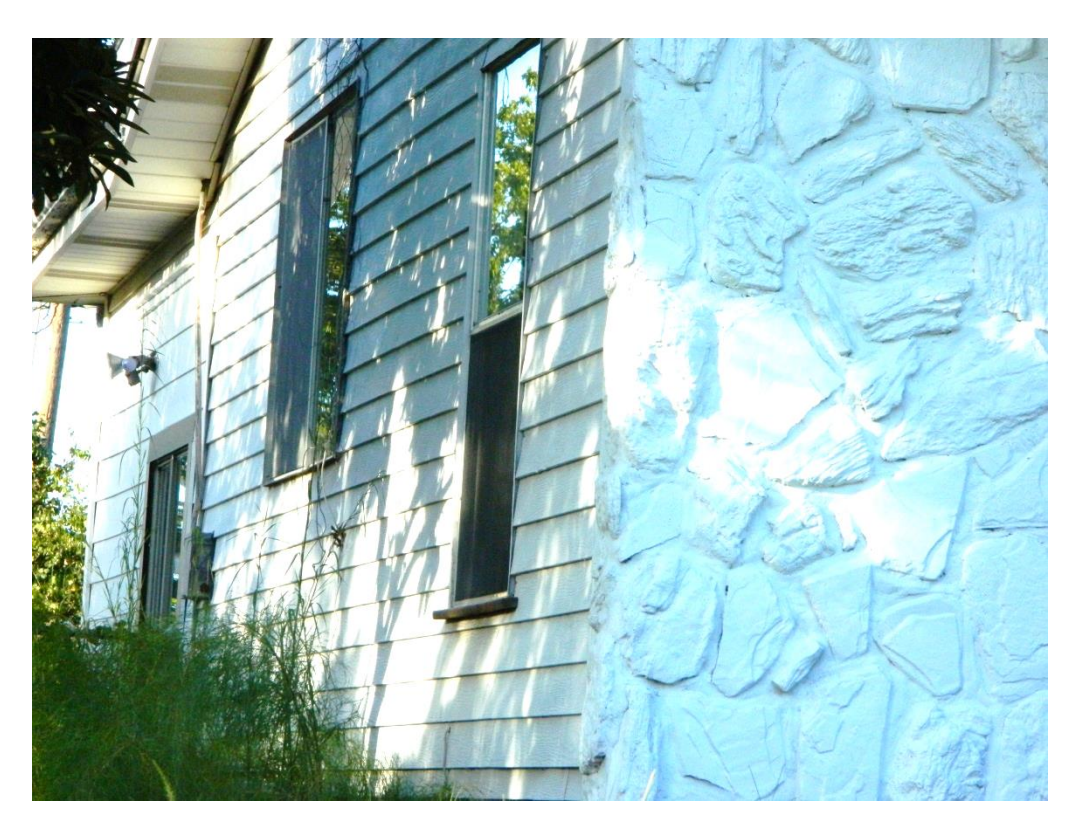
OCCUPANCY HISTORY 1813 McKinley Avenue