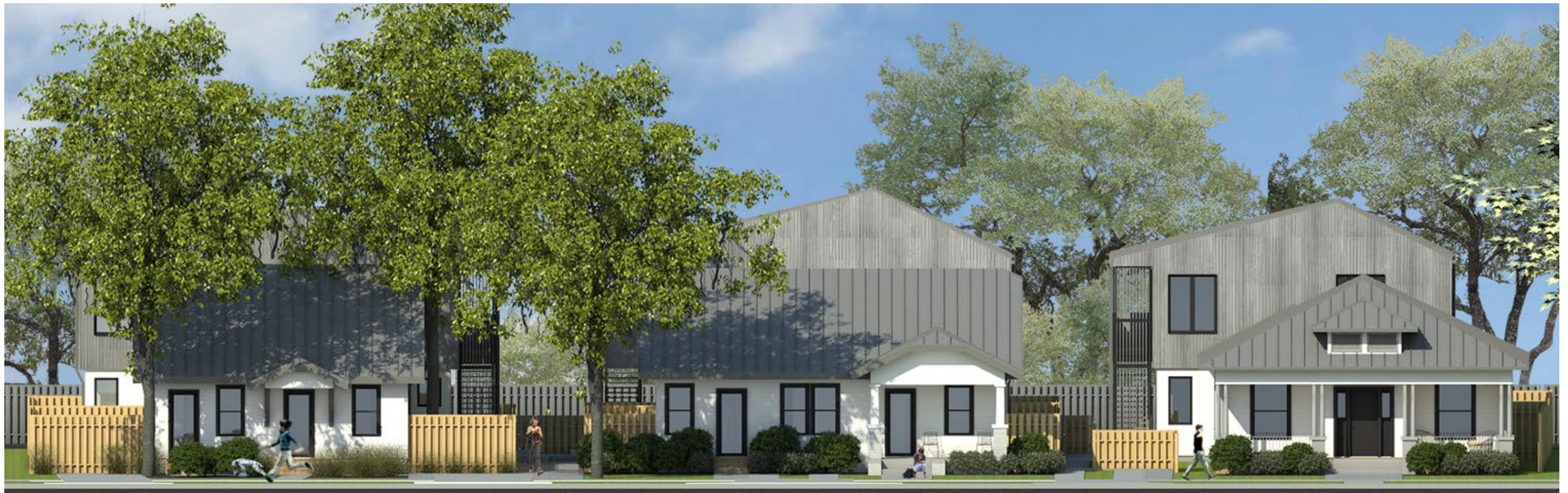
ELEVATION FROM AVENUE C