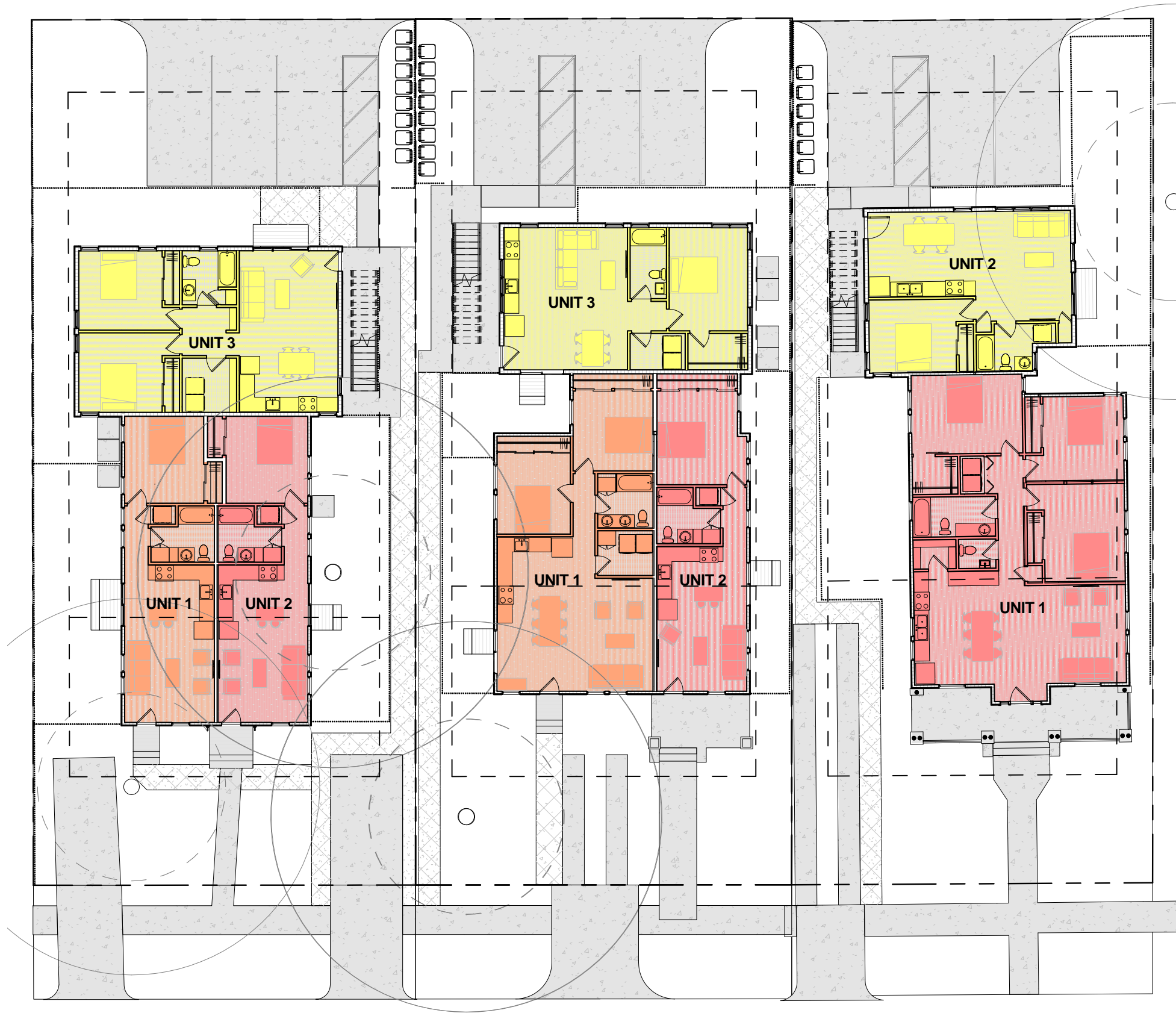
4004 AVENUE C (MF-4) UNITS: 2 X 1BR/1BA, 2 X 2BR/1BA