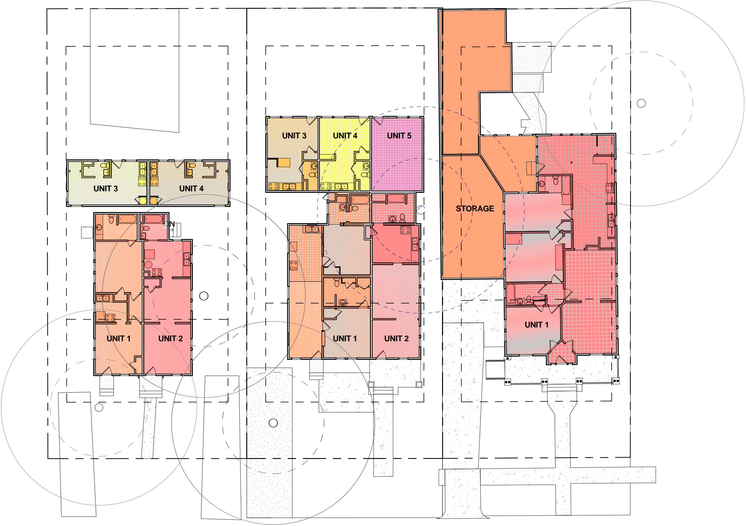
EXISTING 4004 AVENUE C (MF-4)