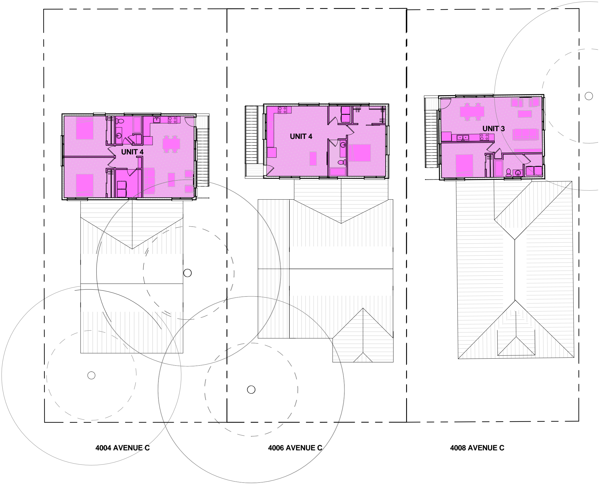
1 NEW LEVEL 2 Scale: 1/16" = 1'-0"