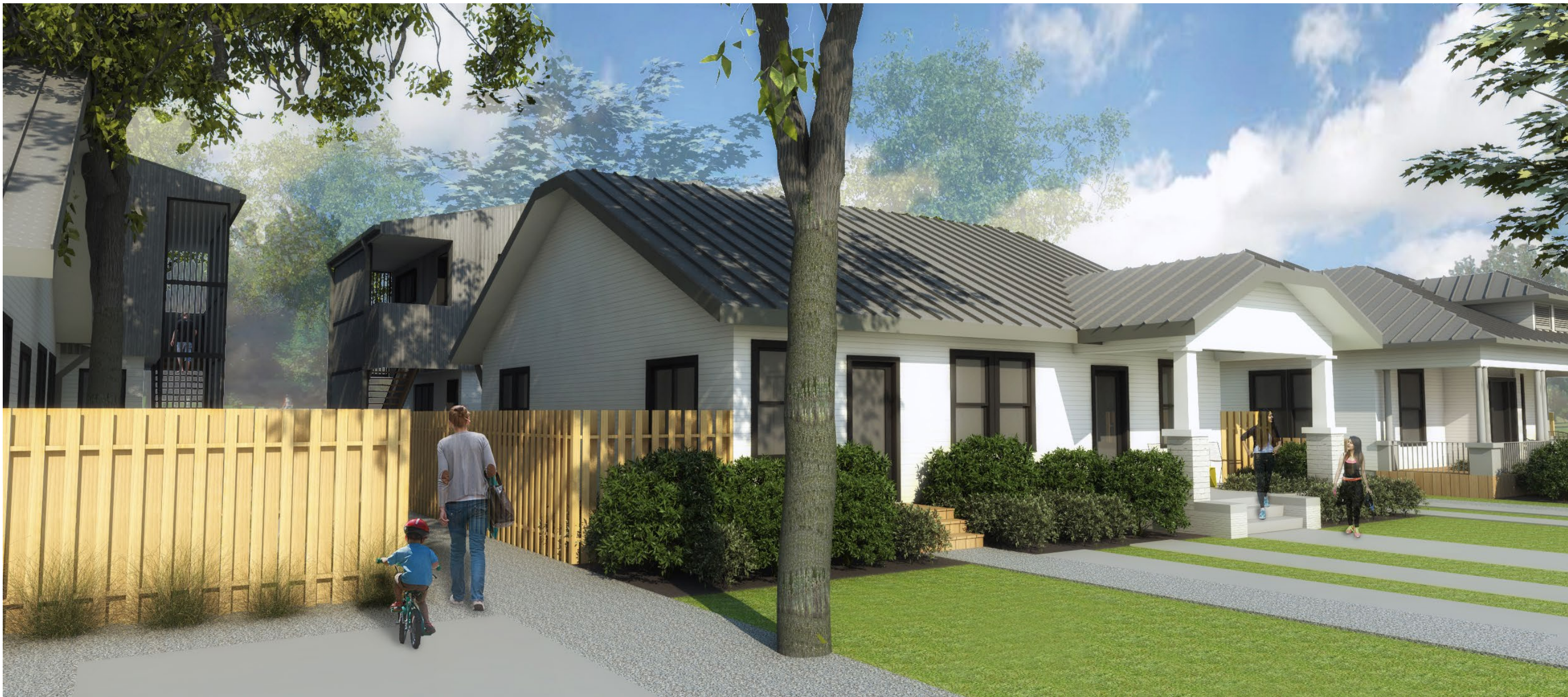
4006 AVENUE C