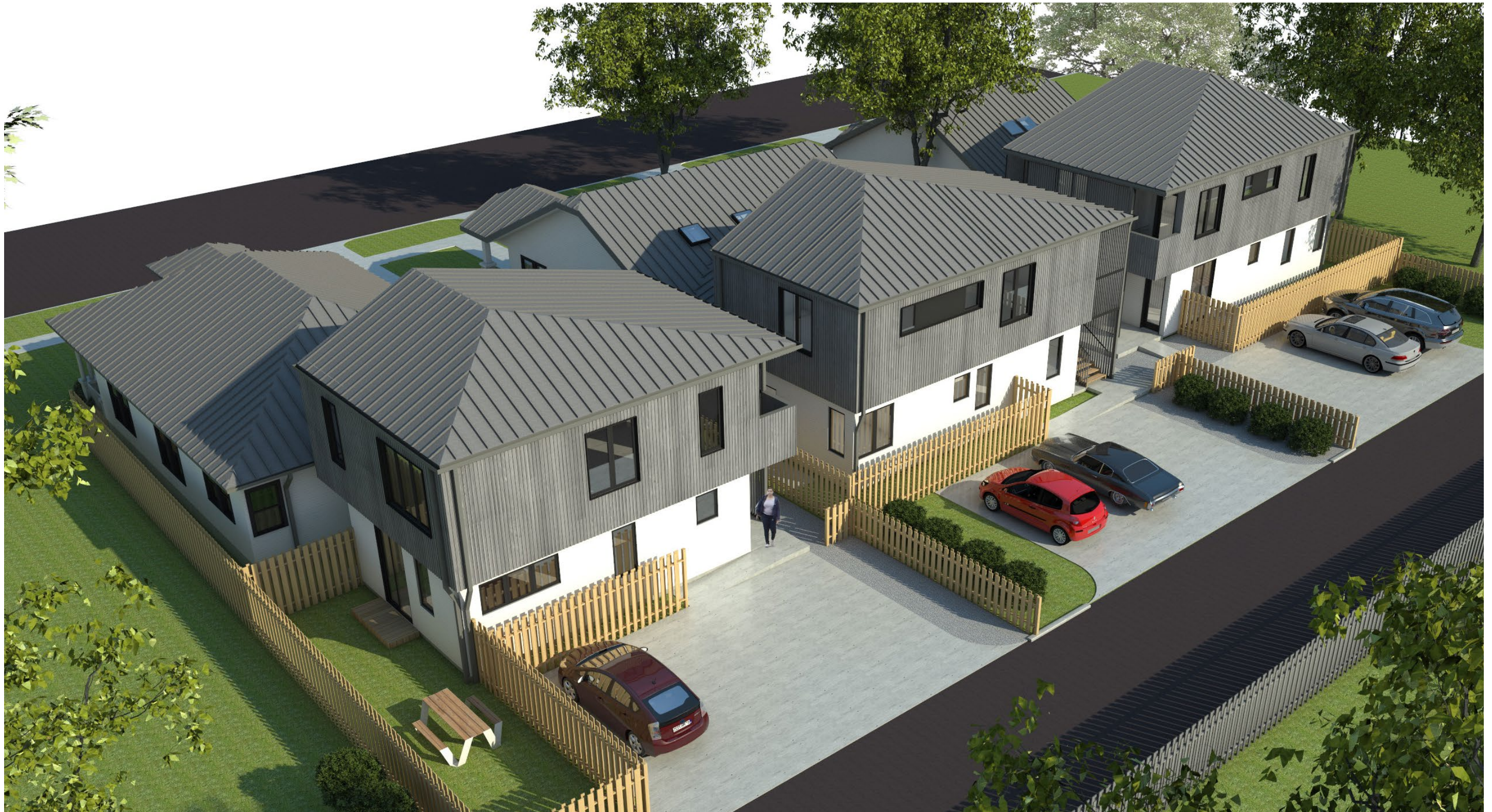
SOUTH VIEW FROM ALLEY