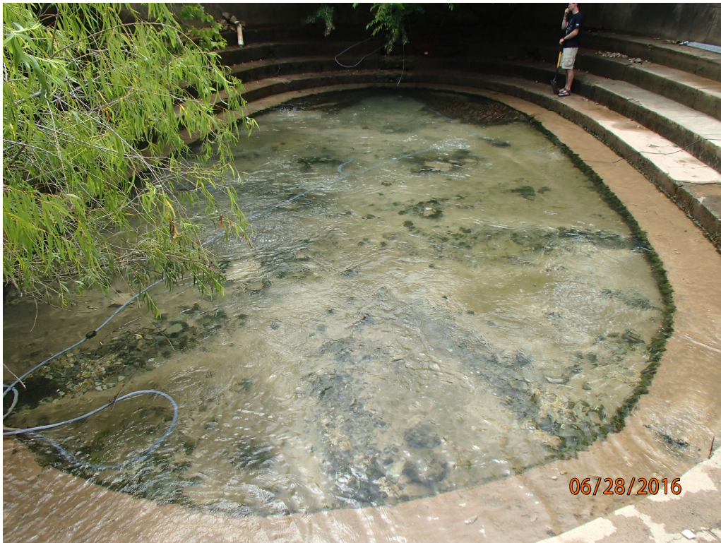
Figure 3. Eliza Spring following drawdown, prior to sediment removal from the spring pool.