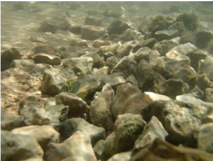
Figure 5. Example of habitat post-sediment removal.