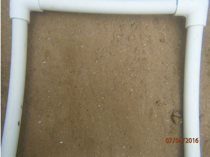
Figure 4. Quadrat demonstrating completely embedded substrate in the center of the spring.